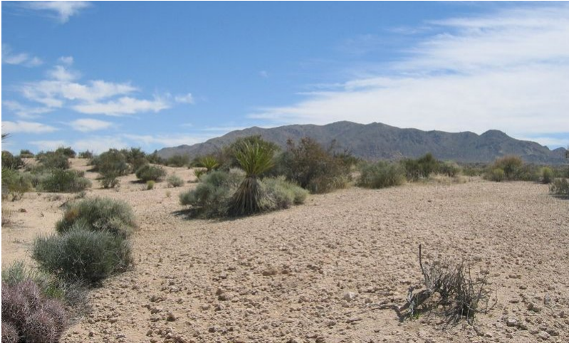
Figure 5. Community Phase 2.1