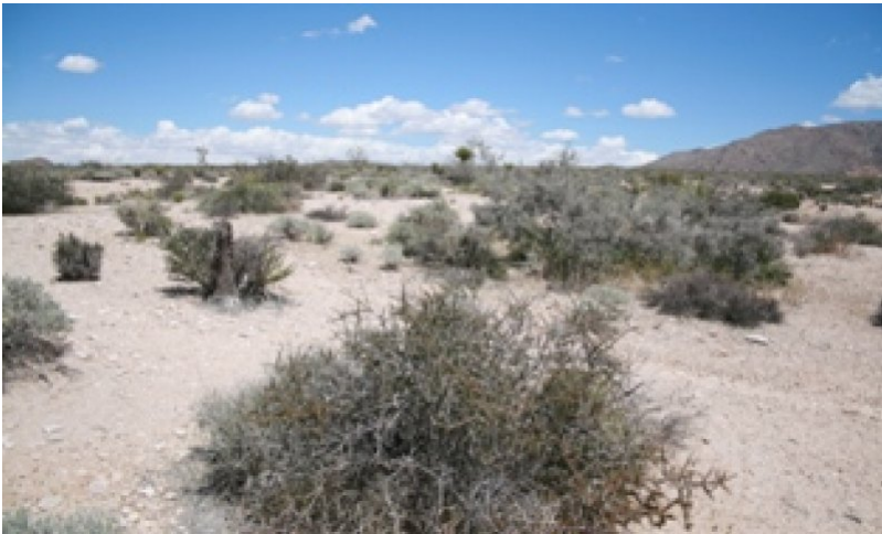
Figure 6. Community Phase 2.1