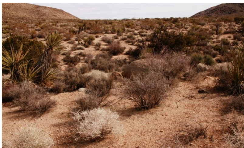
Figure 6. Community Phase 2.1

The reference plant community is co-dominated by blackbrush, and burrobush, and secondary shrub diversity is high. Hall's shrubby spurge, Mojave yucca ( Yucca schidigera ), Parry's beargrass, Nevada jointfir ( Ephedra nevadensis ), and eastern Mojave buckwheat ( Eriogonum fasciculatum ) are important secondary shrubs. Desertsenna ( Senna armata ), Mojave indigobush ( Psoralea arborescens ), lotebush, mouse's eye, waterjacket ( Lycium andersonii ), desert polygala ( Polygala acanthoclada ), and Acton's brittlebush ( Encelia actonii ) may be present. A high diversity of cactus species is typically present, including branched pencil cholla ( Cylindropuntia ramosissima ), golden cholla ( Cylindropuntia echinocarpa ), beavertail pricklypear ( Opuntia basilaris ), cushion foxtail cactus ( Escobaria alversonii ), cottontop cactus ( Echinocactus polycephalus ), and Engelmann's hedgehog cactus ( Echinocereus engelmannii ). The subshrubs Mojave aster ( Xylorhiza tortifolia ), brownplume wirelettuce ( Stephanomeria pauciflora ), narrowleaf bedstraw ( Galium angustifolium ), wishbone bush ( Mirabilis laevis var. villosa ), and desert pepperweed ( Lepidium fremontii ) are typically present. The annual forb component of this