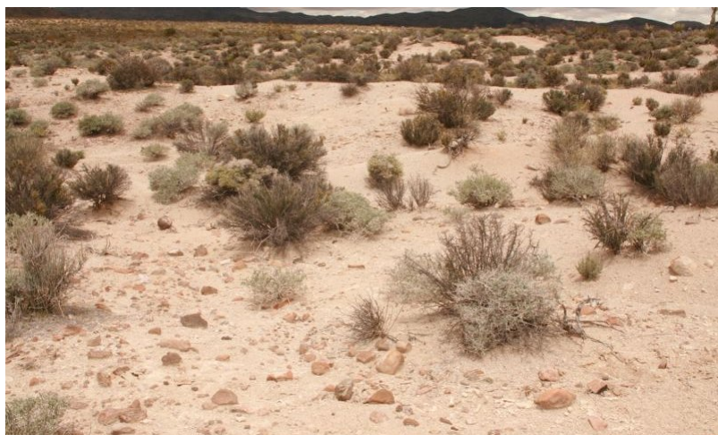
Figure 5. Community Phase 2.1