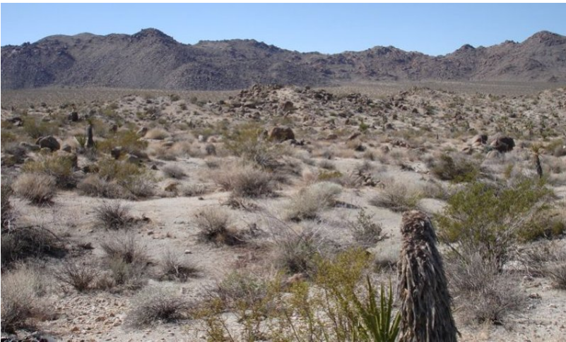
Figure 5. Community Phase 2.1

State 2 represents the current range of variability for this site. Non-native annuals, including red brome, Mediterranean grass, and redstem stork’s bill are naturalized in this plant community. Their abundance varies with precipitation, but they are at least sparsely present (as current year's growth or present in the soil seedbank).