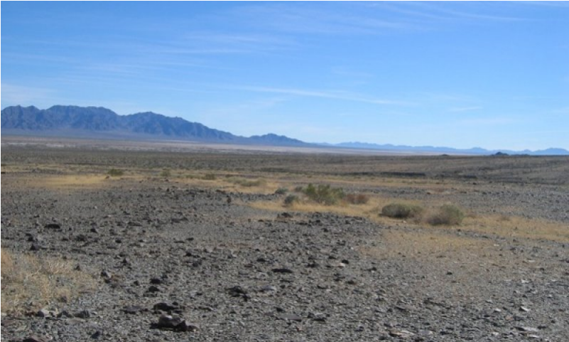
Figure 5. Community Phase 2.1 Desert Pavement

The tightly interwoven rock fragments, in combination with the underlying eolian-deposited horizon create a soil surface that is generally inhospitable to seed germination. Lack of suitable germination sites, creates a barren site with the exception of annual forbs with very shallow root depth requirements and widely scattered creosote bush shrubs. Creosote bush is able to persist due to an ability to establish deep taproots to extract water from deep into the soil profile (sometimes up to 5 m deep), and once established, a positive feedback is developed where infiltration rates are greater directly beneath the shrub. Burrobush and desertholly ( Atriplex hymenelytra ) are occasionally present. Forb cover is low, but may increase in areas with shallow sand or dust deposits over the desert pavement surface. Common forbs are desert marigold ( Baileya multiradiata ), pincushion flower ( Chaenactis fremontii ), cryptantha ( Cryptantha sp.), hairy desertsunflower ( Geraea canescens ), smooth desertdandelion ( Malacothrix glabrata ), and desert Indianwheat ( Plantago ovata ). The small native perennial grass, low woollygrass ( Dasyochloa pulchella ), is present in trace amounts. The non-native annual, Mediterranean grass is present with low cover.