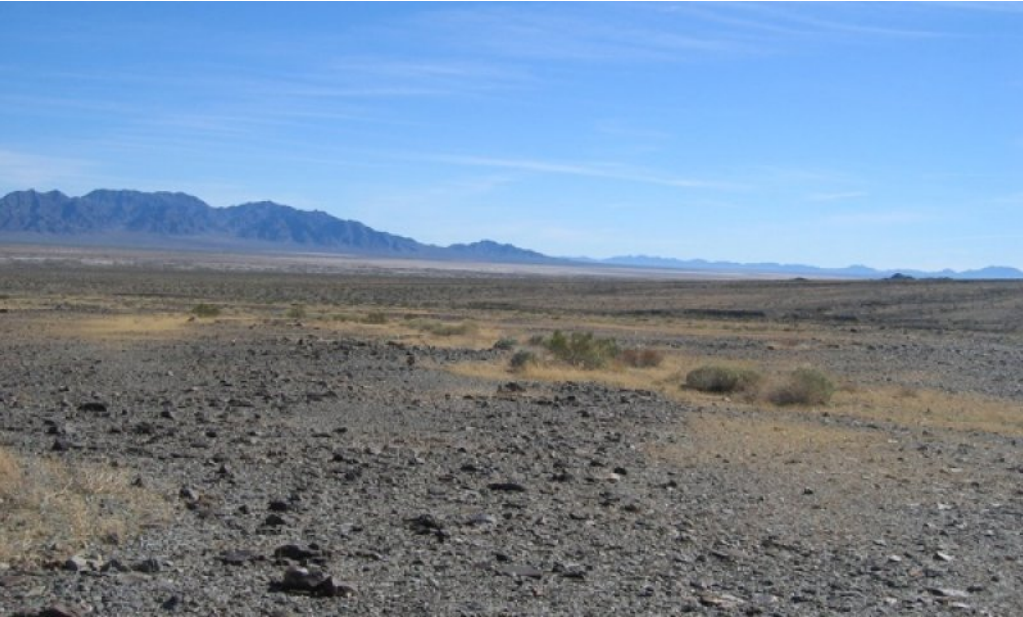
Figure 5. Community Phase 2.1 Desert Pavement

This state represents the most common and most ecologically intact condition for this ecological site at the present time.