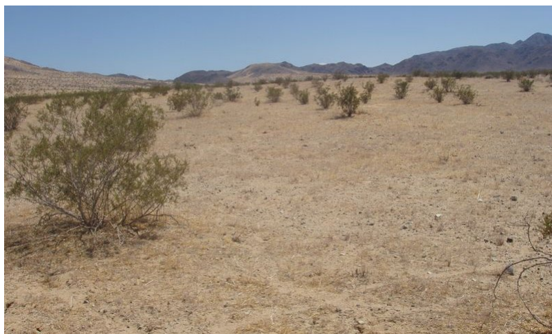
Figure 5. Community Phase 2.1

The reference plant community is maintained by periods of average climatic conditions and the absence of fire. It is dominated by creosote bush. There are no important secondary shrubs, though burrobush ( Ambrosia dumosa ) or white ratany ( Krameria grayi ) are occasionally present at trace levels. The perennial bunchgrass big galleta may be present at very low levels. Native annual forbs are seasonally present, and common species include Cryptantha ( Cryptantha spp.), smooth desert dandelion ( Malacothrix glabrata ), desert Indianwheat ( Plantago ovata ), and devil's spineflower ( Chorizanthe rigida ). Mediterranean grass and redstem stork's bill are typically present at low levels, and Asian mustard may be present at up to 5 percent cover.