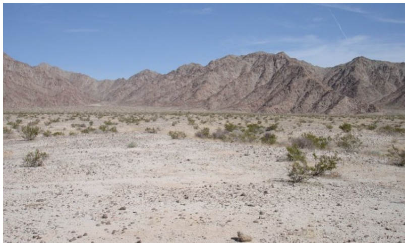
Figure 5. Community Phase 2.1

The reference plant community consists of sparse, small shrubs that are restricted to breaks in the remnant surface. Creosote bush is dominant, and burrobush and white ratany are typically sparsely present. Native annuals are present with average to above average winter precipitation, and common species include cryptantha ( Cryptantha spp.), Esteve's pincushion ( Chaenactis steviodes ), and desert Indianwheat ( Plantago ovata ). The non-native annual's Mediterranean grass and Asian mustard may be sparsely present. Annual cover and production is associated with shrub cover, rivulets in the remnant surface receiving additional run-on, and patches of soil with lower surface rock fragment cover. Soil disturbance, such as from construction or off-road vehicle use, that disrupts rock fragment cover increases colonization opportunities for native and non-native perennials and annuals, and can increase site productivity, especially on deeper soils such as Perurose and Buzzardsprings. This not only increases the susceptibility of this site to invasion by non-native species, but it disrupts the unique soil characteristics that shape the vegetation community of this site.