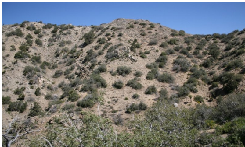
Figure 5. Community Phase 2.1

The current potential plant community is dominated by single-leaf pinyon pine and Muller's oak. Joshua tree ( Yucca brevifolia ) may be very sparsely present. A sparse shrub cover includes narrowleaf goldenbush ( Ericameria linearifolia ), green rabbitbrush ( Ericameria teretifolia ), eastern Mojave buckwheat ( Eriogonum fasciculatum ), grizzlybear pricklypear ( Opuntia polyacantha var. erinacea ), and beavertail pricklypear ( Opuntia basilaris ). Perennial bunchgrasses are sparsely present, and include sandberg bluegrass ( Poa secunda ), desert needlegrass ( Achnatherum speciosum ), Indian rice grass ( Achnatherum hymenoides ), and purple threeawn ( Aristida purpurea ). The loose, erosion prone soils of this ecological site support a diverse subshrub community, these may include granite prickly phlox ( Linanthus pungens ), wishbone bush ( Mirabilis laevis var. villosa ), hoary buckwheat ( Eriogonum saxatile ), grape soda lupine ( Lupinus excubitus ), and the rare San Bernardino milkvetch ( Astragalus bernardinus ). Winter annuals seasonally present are likely to include distant phacelia ( Phacelia distans ), pincushion flower ( Chaenactis fremontii ), and cryptantha ( Cryptantha spp.). The non-native annual cheatgrass may be abundant under tree or shrub canopy, and red brome is typically sparsely present.