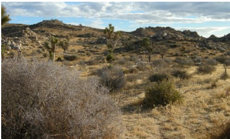
Figure 7. Community Phase 2.3