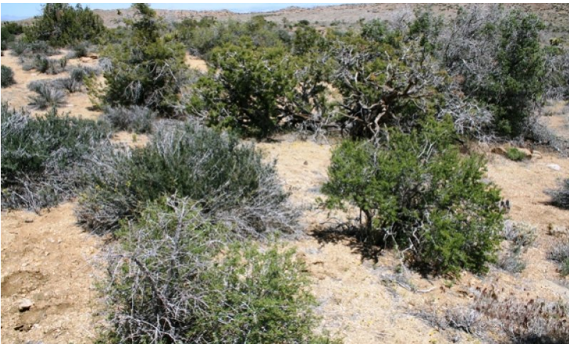
Figure 5. Community Phase 2.1

State 2 represents the current range of variability for this site. Non-native annuals, including red brome and cheatgrass are naturalized in this plant community. Their abundance varies with precipitation, but they are at least sparsely present (as current year’s growth or present in the soil seedbank).