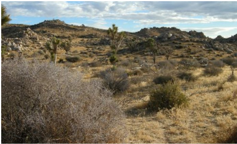
Figure 7. Community Phase 2.3