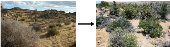
Fire regeneration community