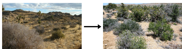
Fire regeneration community