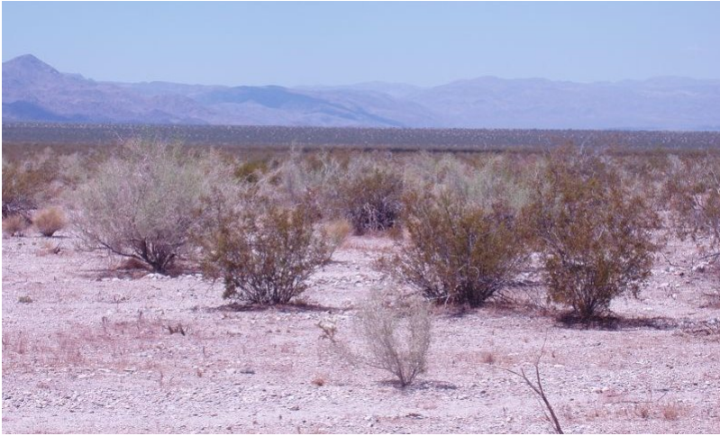
Figure 5. Community Phase 2.1