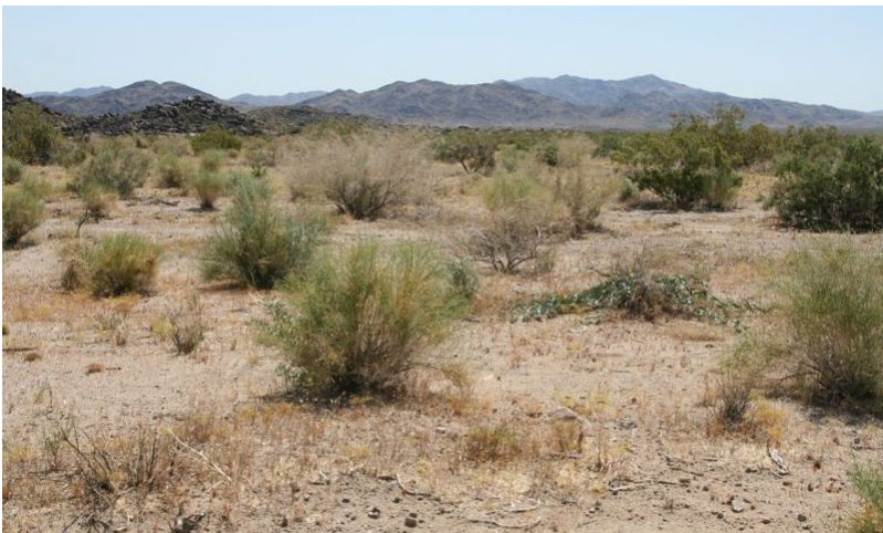
Figure 6. Community Phase 2.1