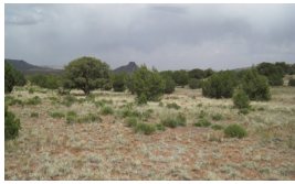
Juniper Overstory with Shrub Understory

Continuous heavy herbivory, unmanaged grazing and drought