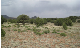
Juniper Overstory with Shrub Understory