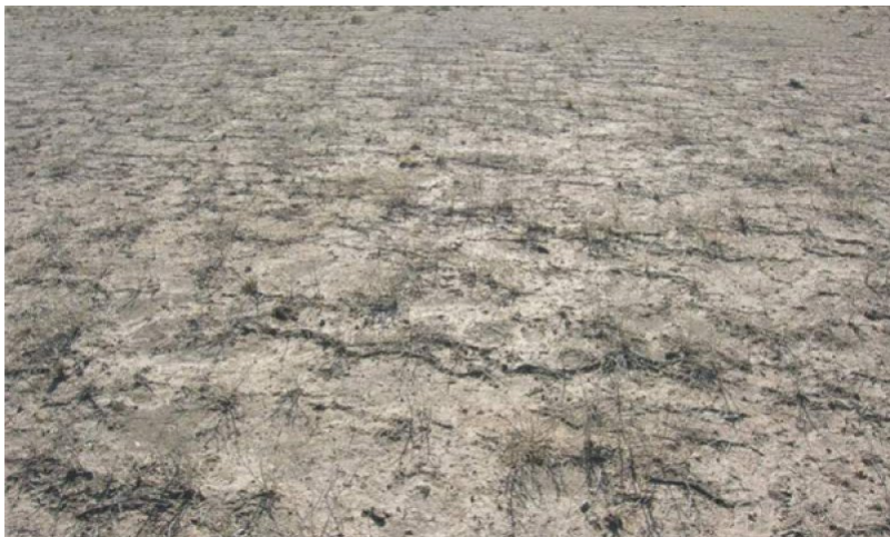
Figure 13. Site dominated by annuals

This site has a degraded plant community dominated by both native and non-native annuals. Annual grasses and forbs composition is over 35 percent of the total plant community. Common annuals include Russian thistle, false buffalo grass, cheatgrass, plantain, stickseed, scorpionweed, globemallows, buckwheats, nightshade and blazingstar. Perennial grasses and/or shrubs may or not be present.