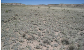
Perennial Native Grassland