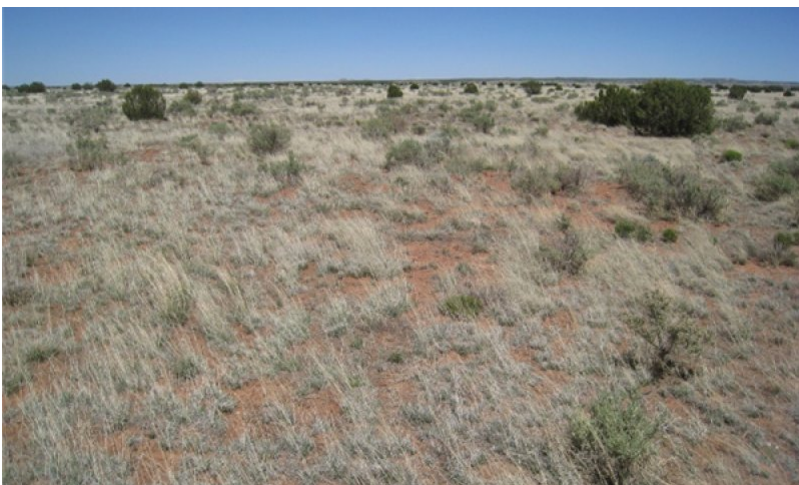
Figure 10. Grassland/Shrubland

The grassland/shrubland plant community is characterized by an increase of composite shrubs (Greene's rabbitbrush and snakeweed) and succulents (Mormon tea, Yucca and cholla) along with desirable shrub species, such as winterfat and fourwing saltbush. Dominate grasses include blue grama, galleta, sand dropseed and Indian ricegrass.