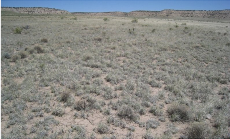
Figure 5. Perennial Grassland

The reference state plant community is composed primarily of warm season mid-grasses and short grasses with a mix of cool season grasses and half-shrubs. Dominant grasses include black grama, blue grama, squirreltail, indian ricegrass, galleta and sideoats grama. Dominant shrubs include winterfat and fourwing saltbush. Natural climatic variation result in changes in the amount of and ratio of both individual plants and warm season versus cool season plants, particularly grasses.