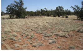
Juniper Overstory with Grass Understory

Managed grazing and favorable precipitation.