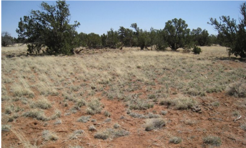
Figure 11. Juniper overstory with grasses

This site is characterized by an increase of juniper canopy greater than 10% with a herbaceous understory dominated by warm season grasses with lesser amounts of forbs and shrubs. Grasses are comprised mostly of blue grama, galleta and dropseeds. Shrubs are mainly comprised of snakeweed, rabbitbrush, yucca and Mormon tea. A lack of fire, lack of grazing management and above normal winter precipitation result in an increase of juniper and cool season annual forbs. Non-native annuals may be present in minor amounts.