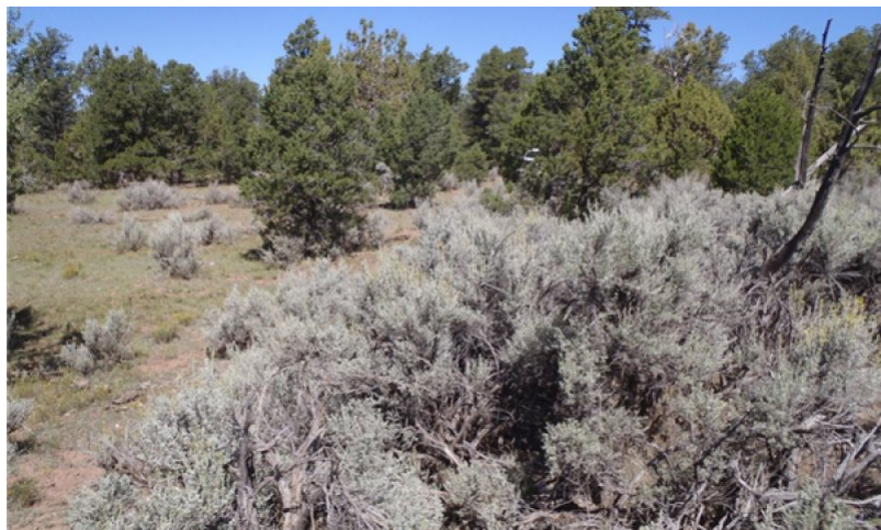
Figure 6. Loamy Upland 13-17" - Community 1.3

This site has a denser overstory of tree species with a crown canopy greater than 55%. The understory has less production than the reference plant community (1.1) with a decrease of grasses, forbs and shrubs. The shrub component moves to become co-dominant to dominant. Dominant shrubs include big sagebrush, broom snakeweed, Bigelow sage and cliffrose. Common grasses include muttongrass, Indian ricegrass, squirreltail and bluegrama.