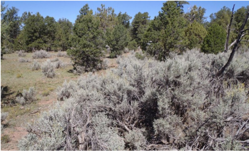
Figure 6. Loamy Upland 13-17" - Community 1.3

This site has a denser overstory of tree species with a crown canopy greater than 55%. The understory has less production than the reference plant community (1.1) with a decrease of grasses, forbs and shrubs. The shrub component moves to become co-dominant to dominant. Dominant shrubs include big sagebrush, broom snakeweed, Bigelow sage and cliffrose. Common grasses include muttongrass, Indian ricegrass, squirreltail and bluegrama.