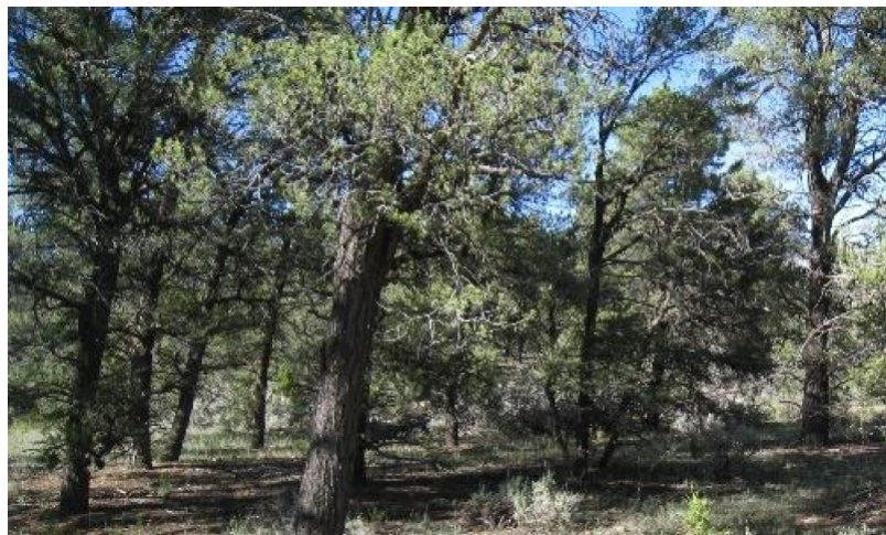
Figure 5. Clay Loam Upland, 13-17"p.z.

This is a woodland site with the overstory dominated by Pinyon (PIED) and Juniper (JUMO). The canopy cover ranges from 55-65%. Pinyon is 75-85% and juniper is 15-25% of the canopy composition. The understory composition is dominated by shrubs (55%); such as black sagebrush, big sagebrush, Gambel oak and Stansbury cliffrose; grasses (30%) such as muttongrass, squirreltail and blue grama; forbs (10%) and trees <4.5' (10%).