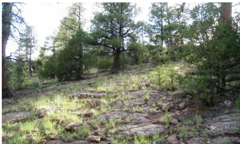
Figure 5. Sandstone hills 17-25" p.z. (PIPO)

This plant community is dominated by mature ponderosa pine with 20 to 35% canopy cover. Cover may be as high as 50% on north facing slopes with 10 - 20% cover of shorter ponderosa pine, Colorado pine, juniper and Gambel oak in the understory. Shrubs are small (<1 m), scattered and make up less than 2% cover. These include Fendler ceanothus and creeping barberry. Grass and forb species range from 5% to 30% cover with lower cover values in areas of dense tree canopy cover and/or bedrock. Perennial grasses are dominated by mountain muhly and blue grama. Perennial forbs are secondary to grasses.