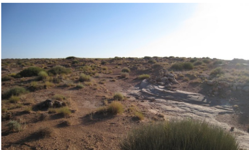
Figure 5. Sandstone Upland 6-10" p.z. Very Shallow