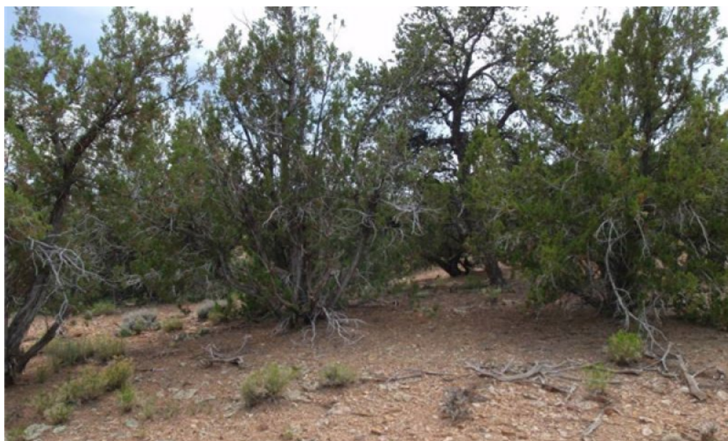
Figure 5. 35.3 Sandstone Upland 10-14" p.z.