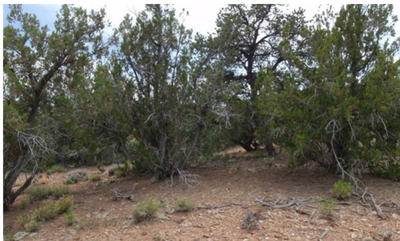
Figure 5. 35.3 Sandstone Upland 10-14" p.z.