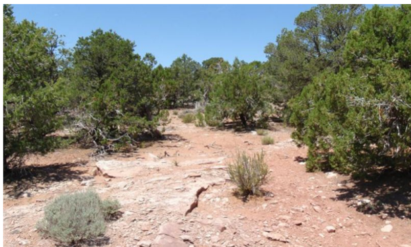
Figure 6. 35.3 Sandstone upland 10-14" p.z.

In this plant community the site is characterized as a forestland with an understory dominated by perennial grasses with scattered shrubs and a few perennial forbs. The tree canopy ranges from 25-35% with Utah juniper and Colorado pinyon as major overstory species. The understory is mostly Indian ricegrass, New Mexico feathergrass, blue grama, needle and thread, Bigelow sagebrush and Stansbury cliffrose.