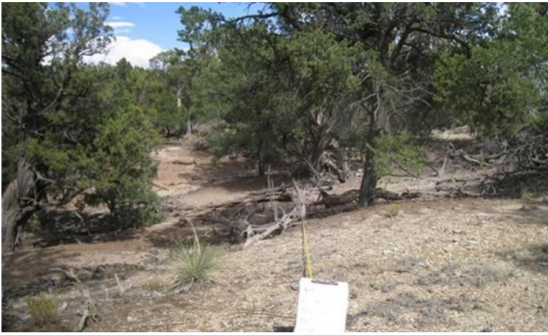
Figure 5. Sandstone Upland 13-17" p.z.

Trees dominate the overstory, but shrubs and grasses are common in the understory. The native overstory canopy is generally 40-50%, but can range from 25-65%. Pinyon pine dominates the canopy at higher elevations and has a more even composition at lower elevations. The understory plant community composition is comprised of about 20% grasses, 55% shrubs, 5% forbs and 20% trees (under 4.5 feet tall). Dominant grasses are muttongrass, squirreltail, blue grama, Indian ricegrass with big sagebrush, green mormon tea, cliffrose and snakeweed.