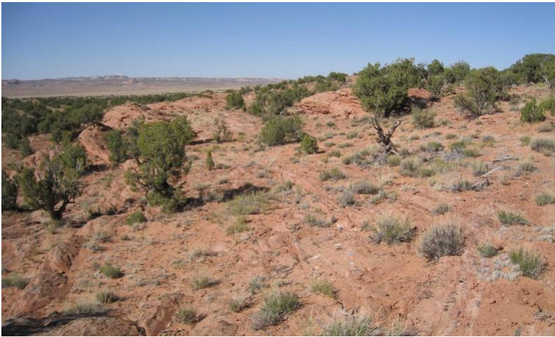
Figure 5. Sandstone Upland, High Precipitation Site

This plant community is made up primarily of warm season grasses with a fair percentage of cool season grasses, shrubs and scattered juniper trees. This community is comprised mostly of grasses (about 70%), followed by shrubs (about 15%), then forbs (about 5%) and trees (about 5%). With continued disturbance the plant community shifts toward a shrub/grass mix and scattered trees with a decline in favorable grasses and shrubs. In this plant community there may be trace amounts (<2% by weight) of non-native annuals present. They do not affect the sites ecological processes in these minor amounts.