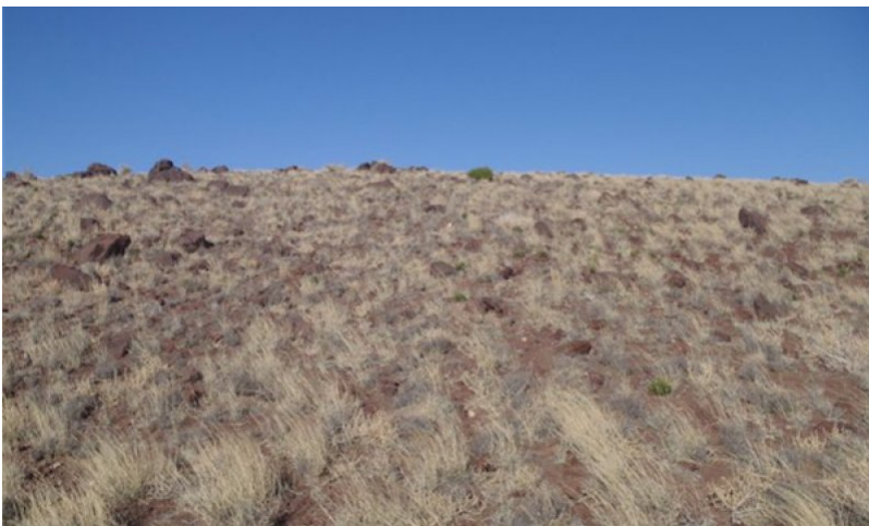
Figure 5. Cinder Hills 10-14" p.z.

This plant community is made up primarily of mid and short grasses with a relatively small percentage of shrubs, half shrubs and forbs. The plant community may have an occasional juniper at higher elevations. There is a mixture of both cool and warm season grasses. Plants most likely to invade or increase on this site when it deteriorates are broom snakeweed, wooly groundsel, annuals, cacti, juniper and rabbitbrush. Unmanaged grazing during the winter and spring periods will decrease the cool season grasses, which are replaced by warm season, lower forage value grasses and shrubs. In this plant community there may be a trace of non-native annuals present. They do not change the sites ecological processes in these minor amounts