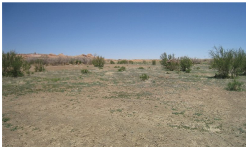
Figure 9. 35.3 Clayey Wash Community Phase 3.1

This site contains an overstory of tamarisk leaving little ground cover. Native shrubs and grasses are being replaced by non-native annual species, such as Russian thistle, in the understory.