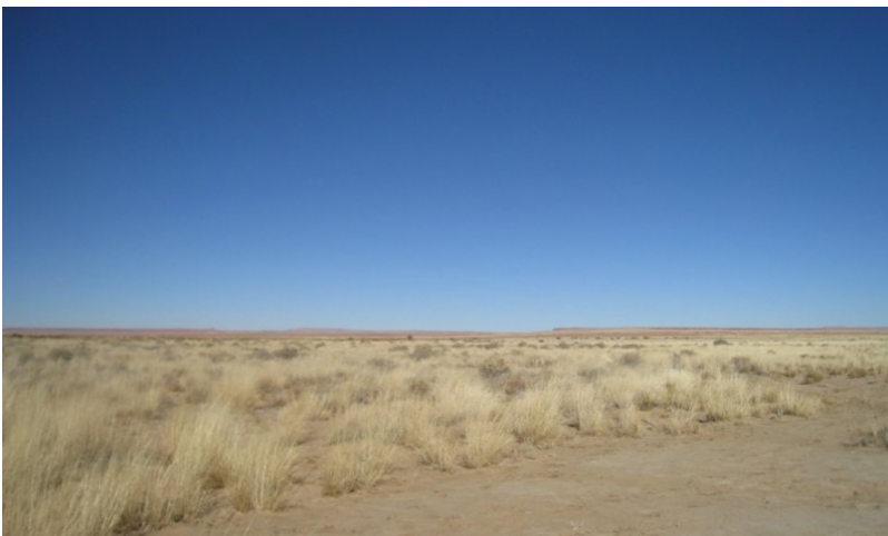
Figure 5. Loamy Wash 6-10" p.z.