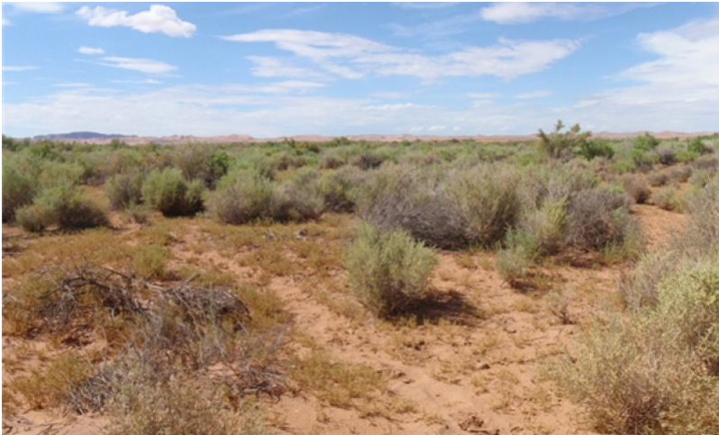
Figure 11. Loamy Wash - Shrubs with Introduced Annuals

This plant community is shrub dominated by rubber rabbitbrush, snakeweed, and fourwing saltbush. Sites adjacent to saline-sodic uplands will occasionally have scattered greasewood or shadscale. There is a sparse understory of perennial grasses and forbs. Annuals, both native and non-natives are well established and are present in moderate amounts and have largely replace the perennials. A loss of biotic integrity and hydrologic function thru the loss of perennial grass cover and incised channels allows for the site to dry. This results in an increase of shrubs.