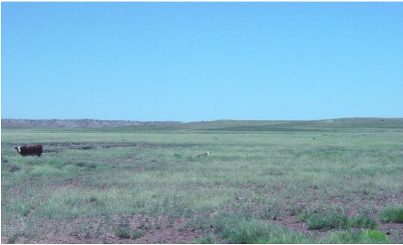
Figure 6. Loamy Wash 6-10" p.z.

Plant community on this site is primarily made up of mid and short grasses and shrubs with a relatively small percentage of forbs. In the plant community there is a mixture of cool and warm season grasses. Dominate species include western wheatgrass, blue grama, alkali sacaton and fourwing saltbush. Plant species most likely to invade or increase on this site when it deteriorates are broom snakeweed, rabbit brush, russian thistle and annuals. Continuous grazing during the winter and spring periods will decrease the cool season grasses, which are replaced by warm season, lower forage value grasses and shrubs.