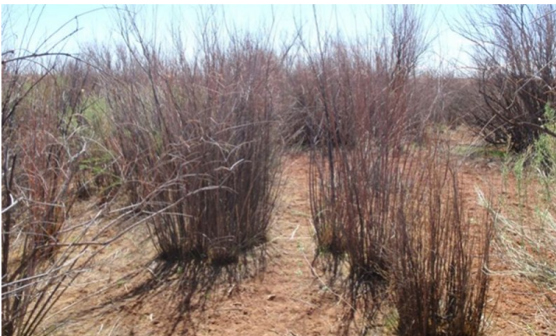
Figure 12. Loamy Wash with Invasive Trees

This plant community contains an canopy of invasive species like tamarisk and/or camelthorn. Native shrubs and grasses are present in small patches. Native shrubs and grasses are being replaced by native and non-native annual species, such as Russian thistle, in the understory.