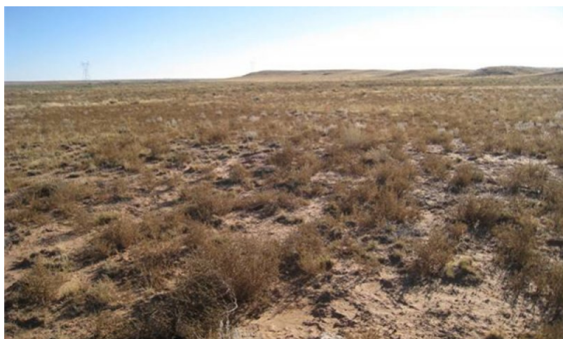
Figure 8. Loamy Upland - Invasive Annuals