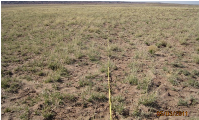
Figure 5. Sandy Loam Upland 6-10" p.z. Saline-Sodic

This plant community is made up primarily of mid and short warm season grasses and cool season grasses with a relatively small percentage of forbs and some low growing shrubs. Dominant grasses are Alkali sacaton and Indian ricegrass with lesser amounts of galleta and dropseeds.