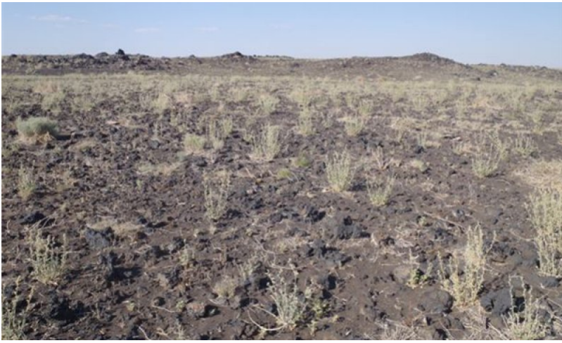
Figure 5. 35.2 Basalt Upland 6-10" p.z.

This plant community is a shrubland with scattered forbs and perennial grasses. The dominant shrubs are shadscale saltbush, fourwing saltbush and rubber rabbitbrush. Galleta is the most common grass and globemallow the most common forb. Russian thistle and other non-native annuals can occur on the site.