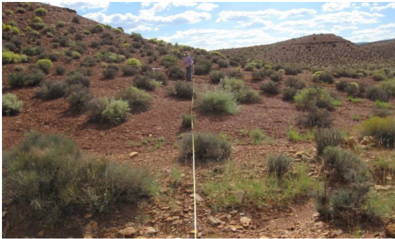
Figure 9. Lower Elevation and Lower Slopes of Ecological Site

The dominant aspect of this site is of blackbrush and Mormon tea. At the lower elevation range of the site the composition of blackbrush decreases with a corresponding increase in jointfir and rubber rabbitbrush. At the higher elevation range of the site oneseed juniper and Colorado pinyon pine are found as well as ash and cliffrose. The major perennial grass, James galleta, is slightly more common on south and west facing slopes. Introduced annuals are now present on the site and compete with natives. The introduced annuals affect the biotic integrity, fire frequency or hydrologic function on the site.