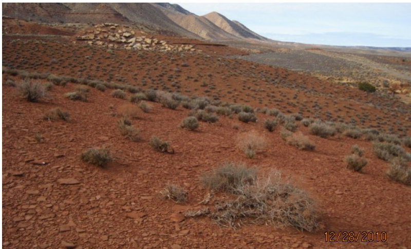
Figure 6. Middle Elevation Range of Ecological Site