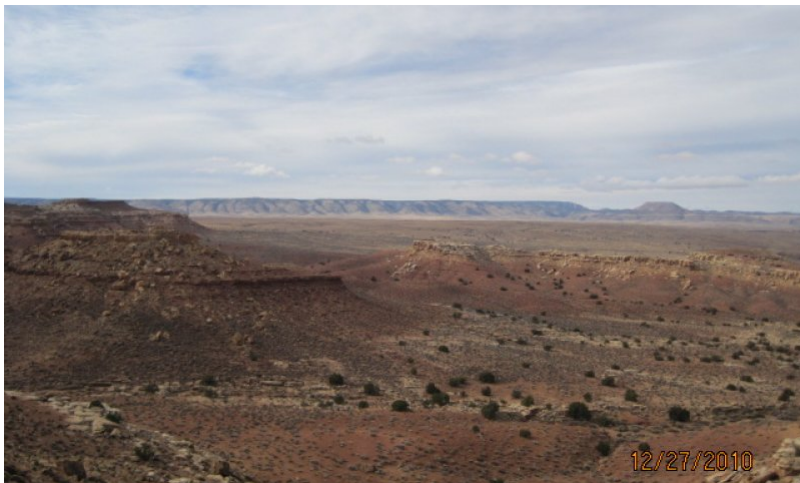
Figure 7. Upper Elevation Range of Ecological Site