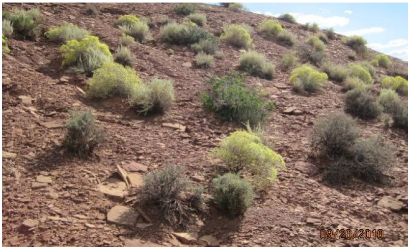
Figure 8. Lower Elevation Range of Ecological Site