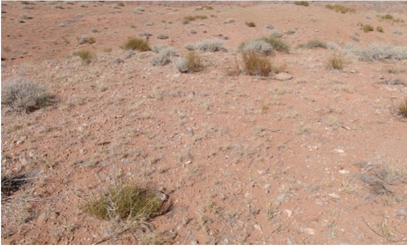
Figure 5. Sandy Loam Upland 6-10" p.z. Limy

This site has a plant community made up primarily of mid and short grasses, short shrubs and a small percentage of forbs. In the original plant community there is a mixture of both cool and warm season grasses. Plant species most likely to invade or increase on this site when it deteriorates are cheat grass, russian thistle, galleta and broom snakeweed. Continuous grazing during the winter and spring will decrease the cool season grasses, which are replaced by lower forage value grasses and shrubs.