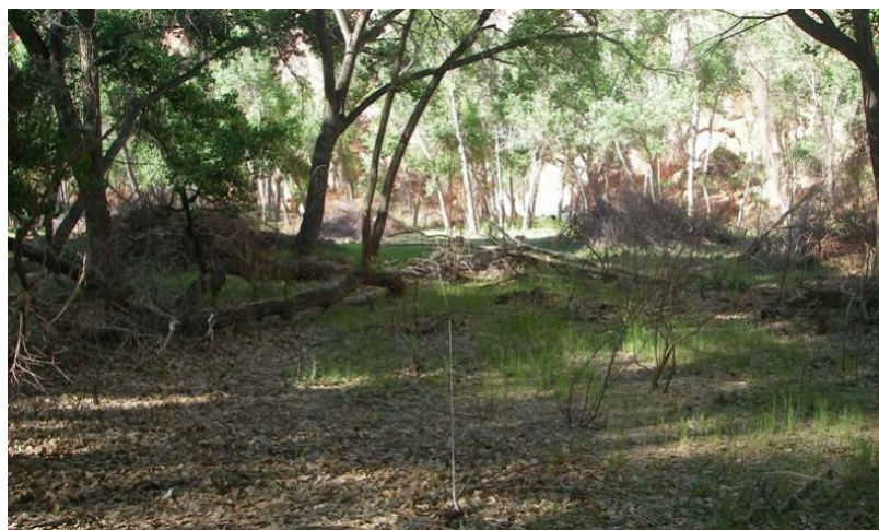
Figure 4. 35.2 Sandy Bottom

This site has a plant community made up primarily of mid grasses, shrubs and Fremont cottonwood trees. Forbs are a minor component of the site. Plant species most likely to invade or increase on this site when it deteriorates are cheatgrass, annual weeds, threadleaf rubber rabbitbrush, tamarisk, Russian knapweed, camelthorn and Russian olive.