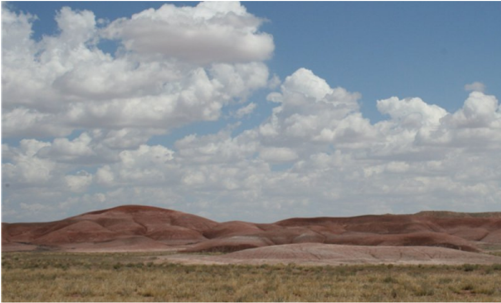
Figure 6. 35.2 Mudstone Slopes

The general aspect of this site is mostly steep, undulating broken badlands with sparse, dissected vegetation. The plant community is made up of primarily of salt tolerant shrubs and midgrasses with a few forbs. The site is comprised mostly of bare ground and fine gravels and less of vegetation. There are pockets vegetations scattered across the site. In the original plant community there is a mixture of both cool and warm season grasses. Plant species most likely to invade or increase on this site when it deteriorates are mound saltbush and annuals forbs.