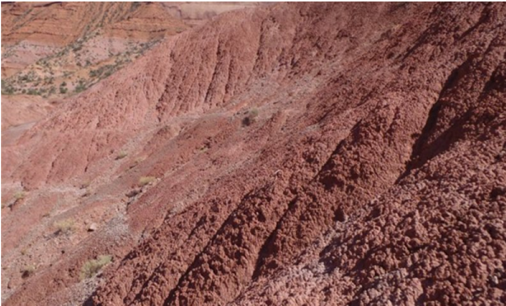
Figure 5. Mudstone Slopes - Sparse Vegetation