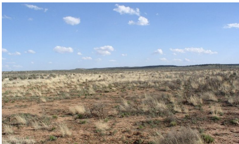
Figure 5. 35.3 Clayey Upland

This plant community is dominated by a mixture of both cool and warm season grasses with scattered shrubs, scattered pinyon and juniper and some forbs. Dominant grasses include; blue grama, black grama, sideoats grama, squirreltail and Indian ricegrass. Shrubs include big sagebrush, fourwing saltbush and Mormon tea.