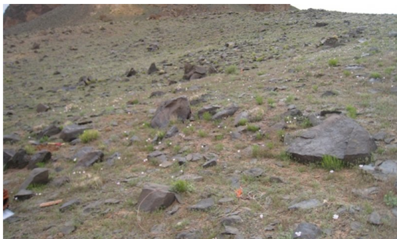
Figure 5. Cobbly Slopes 10-14" p.z. Saline

This plant community is a grassland with mid and short grasses with low growing shrubs and a relatively small percentage of forbs. Major grasses include galleta, alkali sacaton, indian ricegrass and New Mexico feathergrass. Shadscale is the major shrub. Utah juniper can occur on the site. Plant species most likely to invade or increase on this site when it deteriorates are broom snakeweed, mormon tea, sagebrush, and annuals.