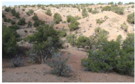
Shrubland with Trees