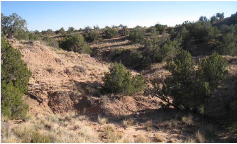
Figure 5. Sandy Slopes 10-14" p.z.