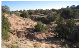
Historic Climax Plant Community

Prescribed grazing, insect infestation (beetle kill) and/or extensive woodcutting, followed by periods of favorable or return normal precipitation events.