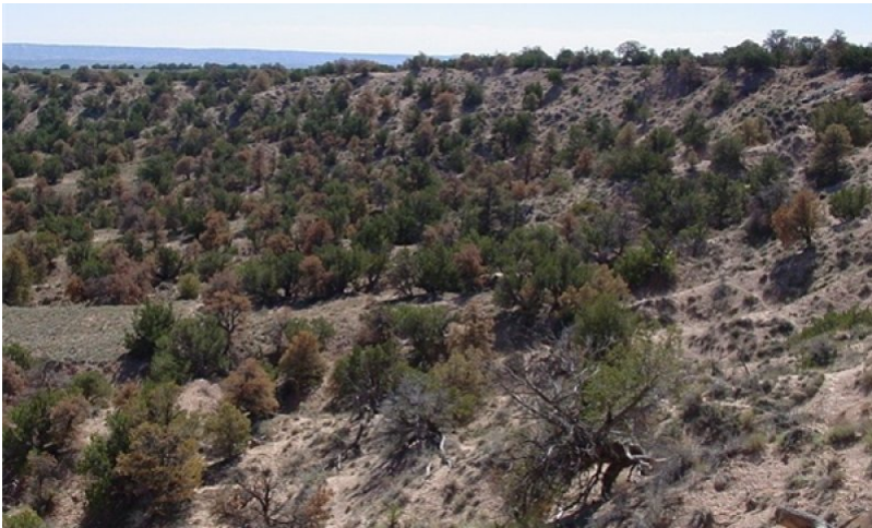
Figure 6. Sandy Slopes 10-14" p.z.

This site has a plant community made up of primarily short and midgrasses with a mixture of shrubs and minor amounts of forbs and scattered trees. Major grasses include blue grama, Indian ricegrass, sand dropseed, needle and thread and black grama. Major shrubs include Wyoming big sagebrush, Greene's rabbitbrush, fourwing saltbush and broom snakeweed and mormon tea. A light overstory (5-15% canopy) of juniper and pinyon pine is present on this site. Plants most likely to increase or invade when the site deteriorates are sandhill muhly, Fendler's threeawn, false-buffalo grass, galleta, rabbitbrush, broom snakeweed, dunebroom and juniper; annual forbs and grasses will invade.