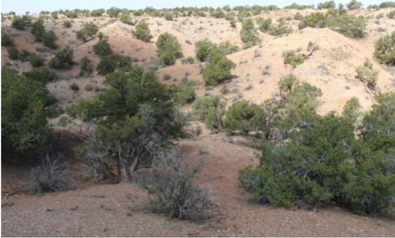
Figure 13. Shrubs and Trees