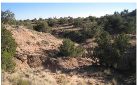
Historic Climax Plant Community