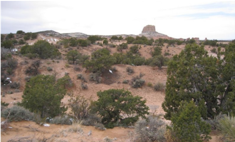
Figure 14. Shrub and Trees

This plant community is characterized by a decline of perennial cool season grasses and an increase of shrubs, especially half shrubs and succulents. Trees cover (up to 25% canopy) may also increase, especially on cooler aspects. Grasses expected to increase are blue grama, galleta, sand dropseed, sandhill muhly and threeawns. Common shrubs include snakeweed, rabbitbrush, mormon tea, cacti, antelope bitterbrush and dune broom.