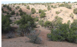
Shrubland with Trees

Unmanaged grazing, natural tree regeneration/lack of fire