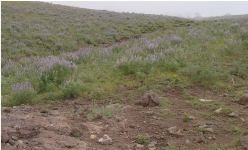
Figure 8. 1.2 Plant Community

This plant community has a perennial grass and forb plant community. There are moderate amounts of annual and perennial forbs in this community.