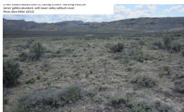
Valley saltbush /James' galleta shrubland