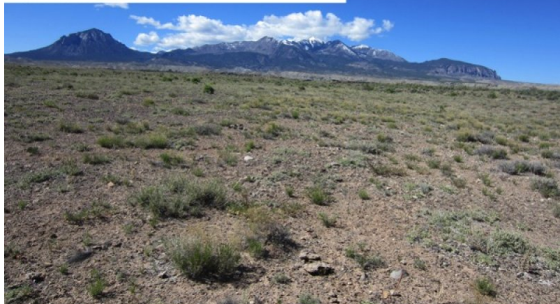
Figure 13. Community Phase 3.1

This community phase is characterized by low cover of valley saltbush, at 4 to 7%. James' galleta is the dominant species, with 5 to 10% cover. Drop-seed grasses ( Sporobolus cryptandrus and S. contractus ), which are more tolerant of grazing, are typically present. Indian ricegrass may be present at low cover. Forbs make a significant contribution to this community phase, although cover and density will vary with precipitation. Freckled milkvetch ( Astragalus lentiginosus ) and woolly plantain ( Plantago patagonica ) are among the more productive forbs that are typically present. Halogeton is prevalent in this community phase, but is still at relatively low cover. Gravels range from 45 to 50%, bare ground 25-30%, litter 5-7% and total foliar canopy 23-27%.