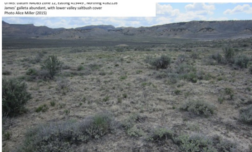
Figure 10. Community Phase 2.2

011110: MATHUWU WAWUWU CURIE 22, CASUING 913449, WUWUWU 9102120 James' galleta abundant, with lower valley saltbush cover (2015)