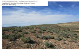
Valley saltbush /Indian ricegrass – James' galleta shrubland

This pathway may occur with time in the absence of further disturbance, and will occur more quickly with favorable precipitation conditions. The time necessary for recovery is unknown; one study found an increase in Gardner's saltbush cover after 14 years of rest from grazing (Goodrich and Zobell 2010). Recovery times will depend on precipitation and the level of degradation.