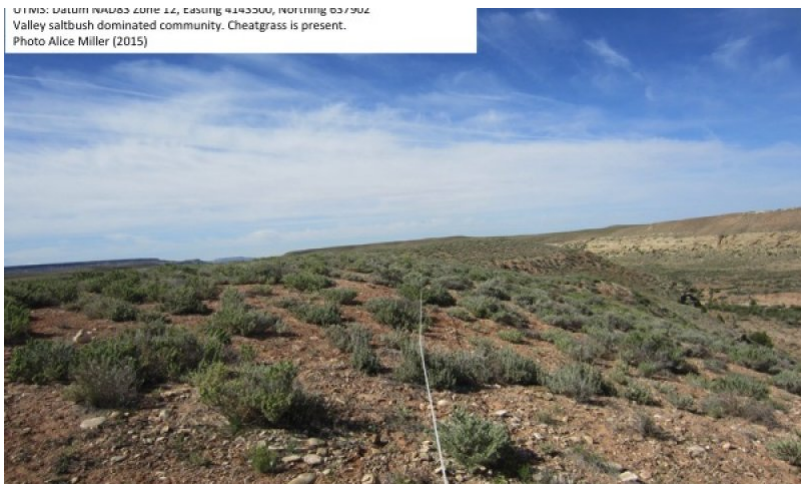
Figure 8. Community Phase 2.1

UTRMS: MONTANA PLANTS COMMUNITY 2.1, EASTERN SALTFLATS, MONTANA 03/2002 Valley saltbush dominated community. Cheatgrass is present.