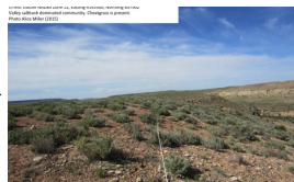
Valley saltbush /Indian ricegrass – James' galleta shrubland

This pathway occurs with wetter than normal, or a return to normal precipitation periods and time, that allow for recruitment and growth of valley saltbush and Indian ricegrass.