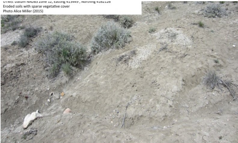
Figure 12. Community Phase 2.3

UTRMS: MATHUWALUOS CURIE 22, CASHTIG 413443, NUTRUM 4102120 Eroded soils with sparse vegetative cover