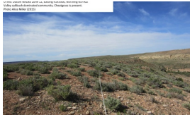
Valley saltbush /Indian ricegrass – James' galleta shrubland