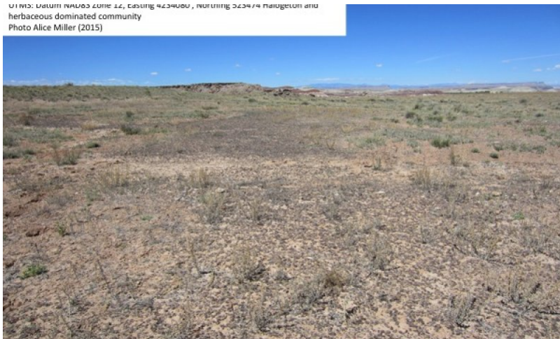
Figure 15. Community Phase 4.1

herbaceous dominated community