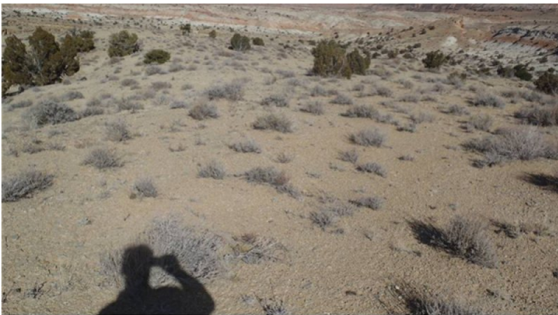
Semidesert Shallow Loam (Torrey's jointfir) community 1.1—Reference Plant Community. Cover is 2% grass,