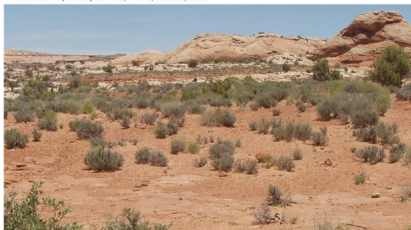
Figure 12. Phase 2.2

Grass/Grasslike community and shrub community are present in the grass community. Sarcobatus community Park Soil Survey. Ashley Garrelts, Photo, June 18, 2008.