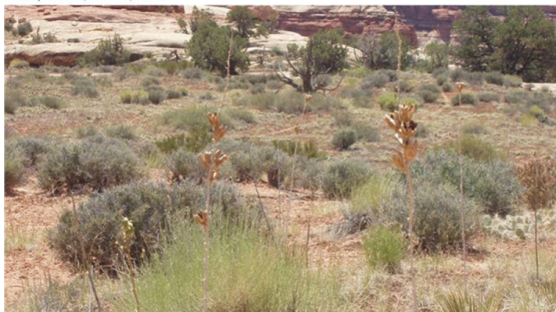
Figure 7. Phase 1.1

Blackbrush and juniper grassland community, California National Park Survey, Photo 2011, photo by Ashley Garrelts, June 20, 2008.