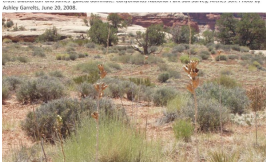
Blackbrush / Perennial Grass