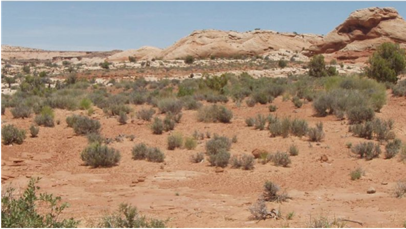
Figure 12. Phase 2.2

Grass/Grasslike: 0-5%, Shrub/Vine: 0-10%, Forb: 0-5%, Tree: 0-5% Park Soil Survey. June 18, 2008.