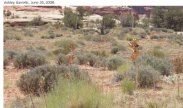
Blackbrush / Perennial Grass

This community pathway occurs when proper livestock grazing, wet weather periods and time allow for the recovery of surface disturbance which increases the amount of perennial herbaceous vegetation on the site.