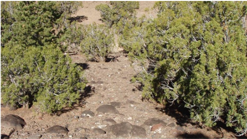
R035XY246UT—Semidesert Stony Loam (Utah Juniper-Pinyon) community 2.1—Utah Juniper-Pinyon