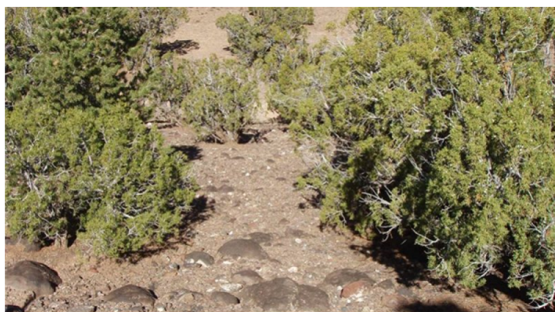
R035XY246UT—Semidesert Stony Loam (Utah Juniper-Pinyon) community 2.1—Utah Juniper-Pinyon