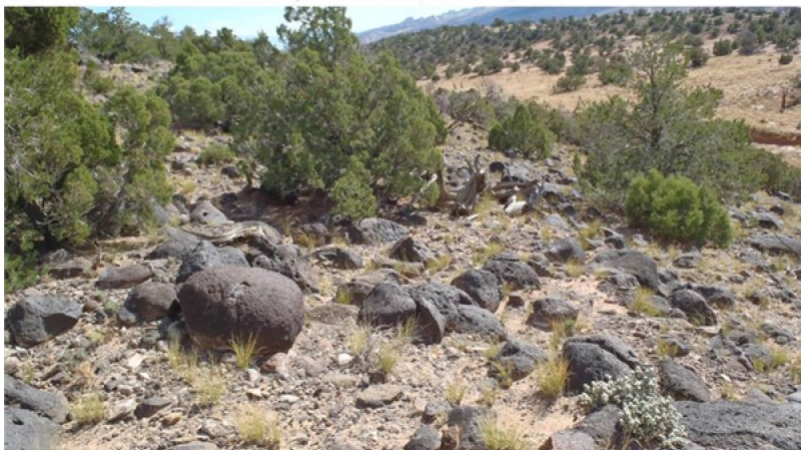
Figure 5. Phase 1.1

The reference plant community is dominated by diverse perennial grasses and Utah juniper. Two-needle pinyon is also abundant, and diverse shrubs and forbs can make up a significant portion of the community in some areas. Composition by air-dry weight is 30-60% grasses, 0-15% forbs, 0-30% shrubs, and 30-60% trees. This phase is resistant to soil erosion as well as invasion by non-native species.