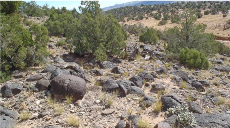
Figure 5. Phase 1.1

juniper, mesquite, and sagebrush, and grasses, and shrubs. GPS coordinates: 36°58'N, 108°55'W, UTM zone 12N, UTM coordinates: NAD83 0469529 E. 4258410 N. October 15, 2011.