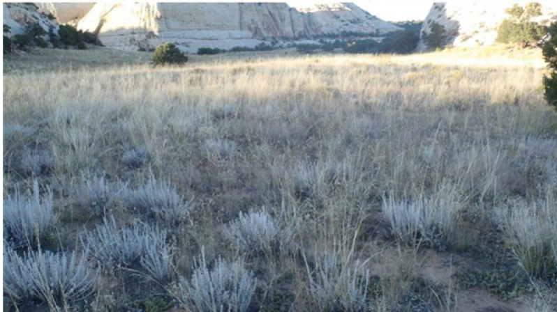
Figure 6. Phase 1.2

Perennial grasses dominate, mainly ricegrass, junegrass, and wiregrass are also abundant. Caprotia, hickory, Soil Survey, Pinepoint soil. NAD 83 125 E. 0468237 N. 4251579. Photo by Jamin Johanson, October 12, 2011.