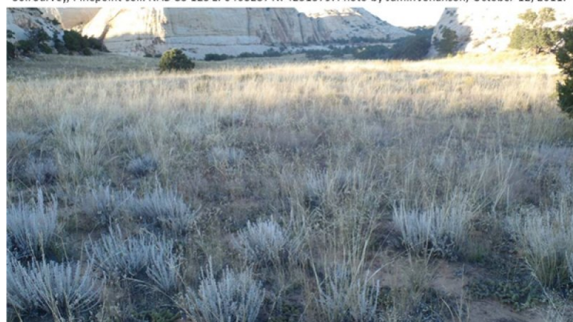
Figure 6. Phase 1.2

Perennial grasses, mainly bluegrass, Indian ricegrass and needle-and-thread are the dominant species here. Soil Survey, Pinepoint soil. NAD 83 125 E. 0468237 N. 4251579. Photo by Jamin Johanson, October 12, 2011.