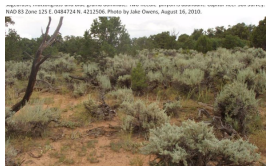
Mountain Big Sagebrush / P-J Encroachment

Time without disturbance results in an increase in woody species, particularly two-needle pinyon, Utah juniper, and sometimes mountain big sagebrush. Perennial grasses are reduced, but still capable of propagating themselves in the event of woody plant reduction by fire or other disturbance.