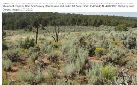
Mountain Big Sagebrush / Perennial Grass