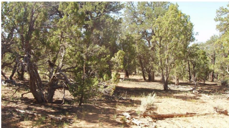
Figure 18. Phase 3.1

Two-needle pinyon and Utah juniper dominate. Mountain big sagebrush and other shrubs are still abundant in the understory, but perennial grasses and forbs are greatly reduced. Trees continue to increase in the absence of fire or other tree reducing disturbance.