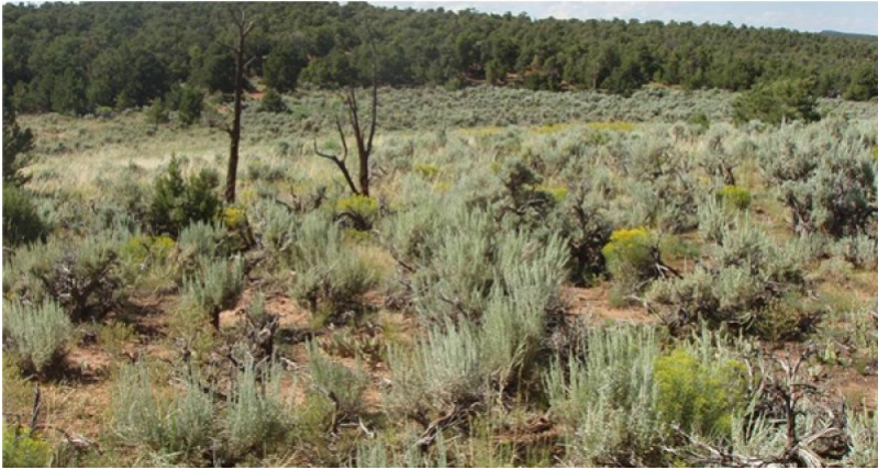
Figure 7. Phase 1.1

Sagebrush and perennial grass communities. Blue grama, yellow rabbitbrush, and prairie junco are also abundant. Capitol Reef Soil Survey, Plumasano soil. NAD 83 Zone 12S E. 0485249 N. 4207917. Photo by Jake Owens, August 17, 2010.