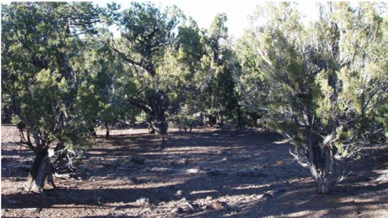
Figure 20. Phase 3.2

4262601. October 14, 2010.