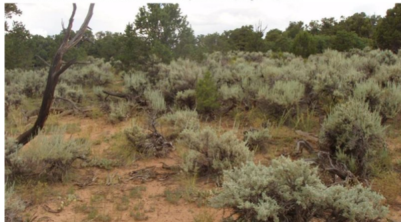
Figure 10. Phase 1.3

Vegetation, mountain big sagebrush and tree grass communities, two needle pinyon and Utah juniper, capture best community. NAD 83 Zone 12S E. 0484724 N. 4212506. Photo by Jake Owens, August 16, 2010.