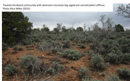
Mountain big sagebrush - cliffrose shrubland