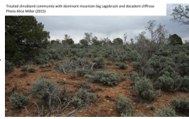
Treated shrubland community with dominant mountain big sagebrush and deadwood Mountain big sagebrush - cliffrose shrubland

This pathway occurs with chaining and/or tree removal that targets established Utah juniper and twoneedle pinyon to return the community to a shrub dominated phase. Land managers have treated large areas of this ecological site to improve habitat for wildlife. The effectiveness of this treatment is unknown; however, cliffrose recruitment was not observed in any treated areas.