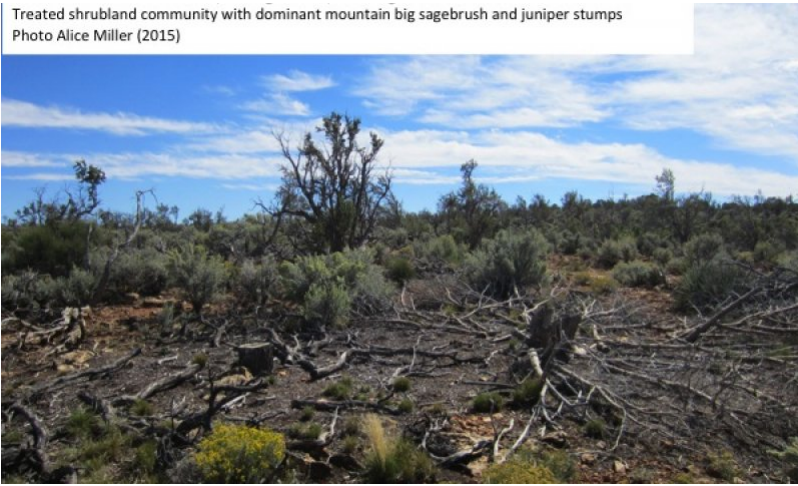
Figure 12. Community Phase 2.3, treated juniper

A natural example of this community phase was not observed; however, data was collected in areas treated by tree thinning and clearing with slash left in place to improve the structure of the shrubland community and improve wildlife habitat (BLM 2004). This community phase is characterized by strong shrub dominance with only 0-2% tree cover. Total canopy cover averages 38%. Mountain big sagebrush cover ranges from 18-23% and cliffbrush cover ranges from 3-5%. Abundant mountain big sagebrush recruitment was observed in this phase, but no recruitment of cliffrose was seen. Secondary shrub and herbaceous species composition remain similar to community phase 2.1, although broom snakeweed and Mormon tea are typically more abundant in this community phase. Cheatgrass may be abundant, and redstem stork's bill may be present. Bare ground ranges from 6-20%, litter 8-17%, woody debris 11-15%, gravels 5-22%, cobbles 4-5%, and BSC 0-6%. With a lack of recruitment, no fire or seeding, cliffrose may eventually be extirpated from this community, leading to an altered state. This is not included in the state and transition model, but managers should be aware of the potential.