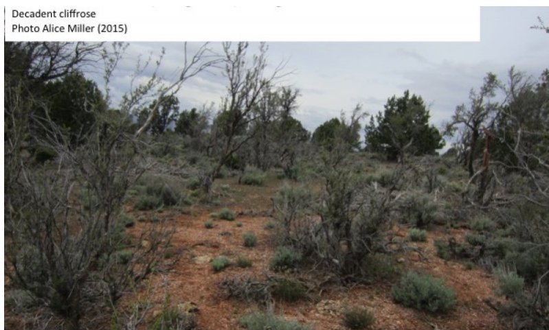
Figure 9. Decadent cliffrose, community phase 2.1

This community phase is characterized by 8-12% canopy cover of short-statured Utah juniper and twoneedle pinyon over 18-22% shrub canopy, with mountain big sagebrush dominant and cliffrose an important co-dominant. Shrubs are typically decadent, with little recruitment and tall cliffrose with branches above browseline. Recruitment of Utah juniper and twoneedle pinyon is evident with 1-2% cover of regenerating juniper and up to 1% cover regenerating pine. Total canopy cover averages 36%. Secondary shrubs have low cover and production, and common species include Mormon tea ( Ephedra viridis ), broom snakeweed ( Gutierrezia sarothrae ), narrowleaf yucca ( Yucca angustissima ), plains pricklypear ( Opuntia polyacantha ), Gambel's oak ( Quercus gambelii ), whipple