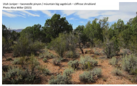
Utah juniper - twoneedle pinyon / mountain big sagebrush - cliffrose shrubland