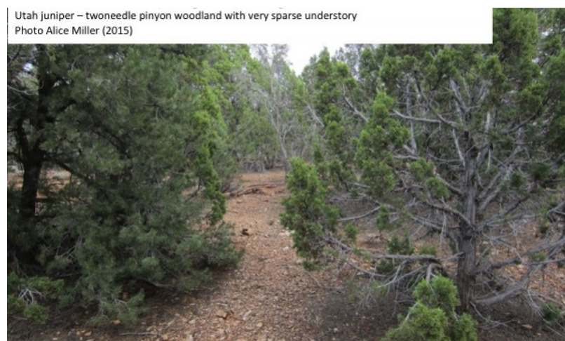
Figure 14. Community Phase 2.4

Data was not collected for this community phase, but it was observed and documented. This community phase is characterized by tree dominance, and a loss or significant decline in the understory. Dominant shrubs are shaded out and die, with a lack of recruitment opportunities, do not re-establish. This community phase may naturally return to a mountain big sagebrush – cliffrose shrubland through fire, which clears the tree canopy and provides open ground for shrub recruitment. Alternatively manual treatment such as chaining or otherwise thinning or removing trees may shift the community to C.P. 2.3.