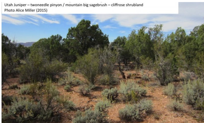
Figure 8. Community Phase 2.1