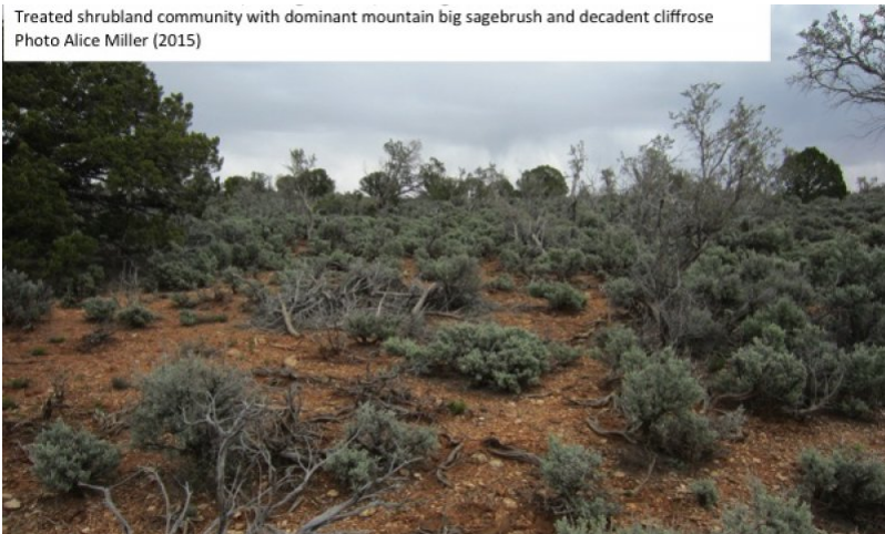
Figure 11. Community Phase 2.3

Treated shrubland community with dominant mountain big sagebrush and decadent cliffrose