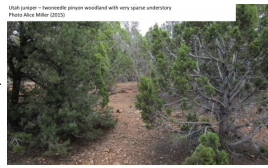
Utah juniper - twoneedle pinyon sparse woodland

This pathway occurs with a very long period of time between fire events (perhaps naturally occurring at the latter stages of the fire return interval), and is accelerated and maintained by overbrowse or overgrazing that prevents recruitment of dominant shrub species.