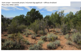
Utah juniper - twoneedle pinyon / mountain big sagebrush - cliffrose shrubland