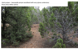
Utah juniper - twoneedle pinyon sparse woodland