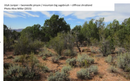
Utah juniper - twoneedle pinyon / mountain big sagebrush - cliffrose shrubland

This pathway occurs with time without further disturbance, allowing Utah juniper and twoneedle pinyon to establish and grow.