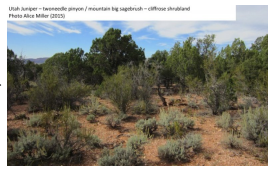
Utah juniper - twoneedle pinyon / mountain big sagebrush - cliffrose shrubland

This restoration pathway occurs with chaining and/or tree removal that targets established Utah juniper and twoneedle pinyon pine to return the community to a shrub dominated phase. Seeding may be necessary to re-establish mountain big sagebrush and cliffrose, and fire may be more effective to return this community to a desired phase.