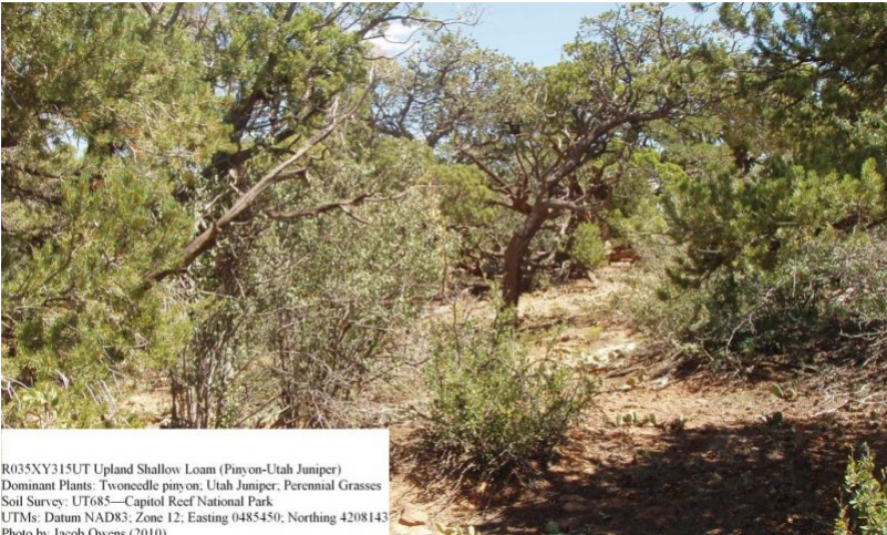
Figure 4. Reference State

pinyon and Utah juniper, where shrubs, and native perennial grasses and forb production is variable. Feedbacks: Disturbances that may allow for the establishment of invasive species. At-risk Community Phase: this community is at risk when native plants are stressed and nutrients become available for invasive plants to establish. Trigger: The establishment of invasive plant species.