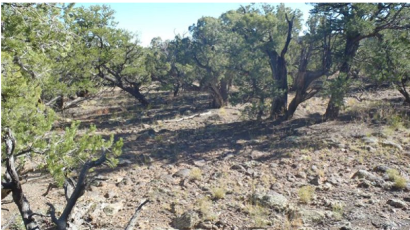
R035XY321UT—Upland Stony Loam (Pinyon-Juniper). Community Phase 1.1—Reference State. Cover is 8%