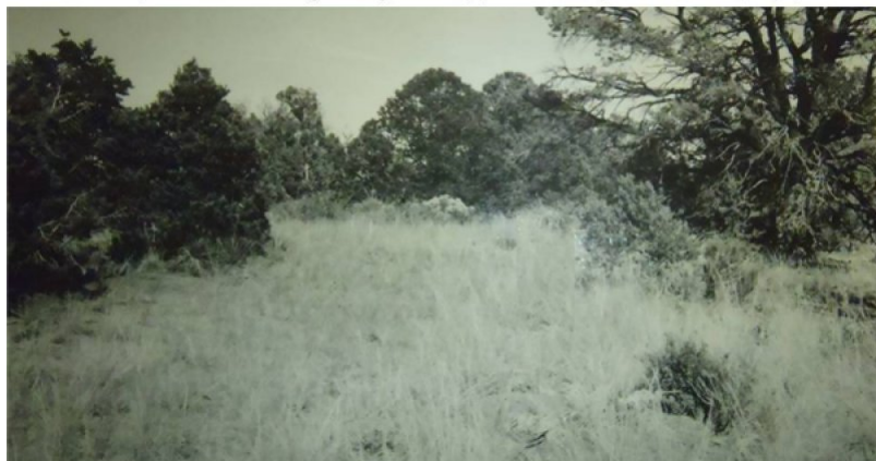
Figure 5. Phase 1.1

primary plant are the most abundant species: mesa ricegrass, needle and thread, mountain and pine species are common. Mason LR, Andrews HM, Carley JA, Haacke ED. 1967. Vegetation and soils of No Man's Land Mesa relict area, Utah. Journal of Range Management 20(1):45-9. Photo by Horace Andrews, July 6, 1964.