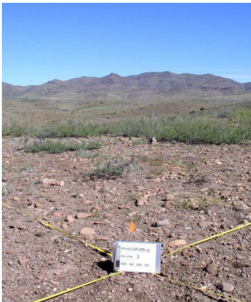
Figure 13. Eroded

Shrubs like mesquite, paloverde and whitethorn acacia; trees like juniper and canotia; and succulents like prickly pear and banana yucca can increase to dominate the site. Non-native annual forbs and grasses dominate the