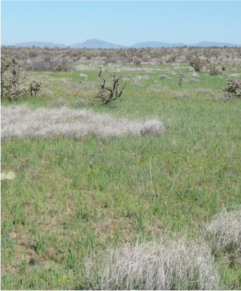
Figure 8. Annuals

Palatable midgrasses have been replaced by annual species. Tobosa still occurs in normal amounts. Non-native annual grasses like red brome, wild oats, mediterranean grass (schismus) and cheatgrass can invade and dominate areas of the site. These species can, over time, reduce the seed-bank of native annual grasses and forbs. Their presence can increase the fire frequency (of man made fires) especially where roads and urban areas are adjacent to areas of the site. Repeated fires tend to remove the native shrub, grass and forb canopy.