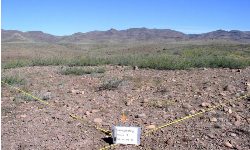
Figure 12. Clayloam Upland 12-16" pz., erosion