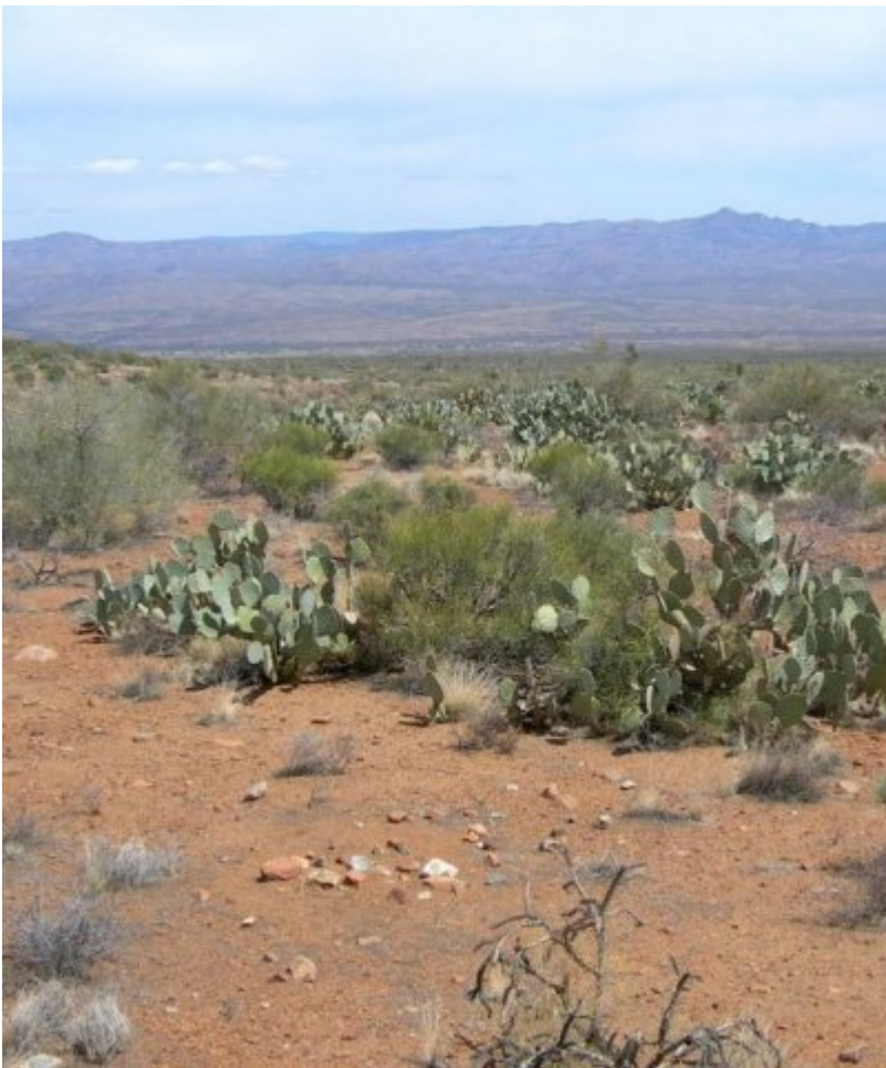
Figure 10. Shrub Increase