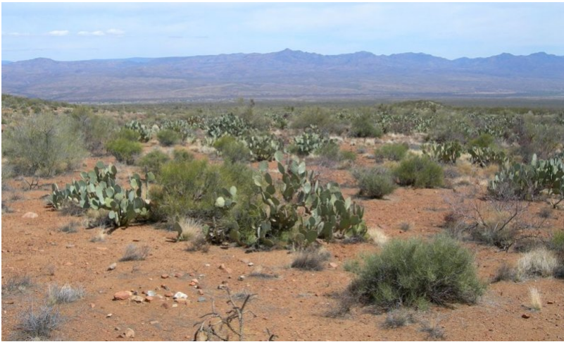
Figure 9. Clayloam Upland 12-16" pz., shrubby