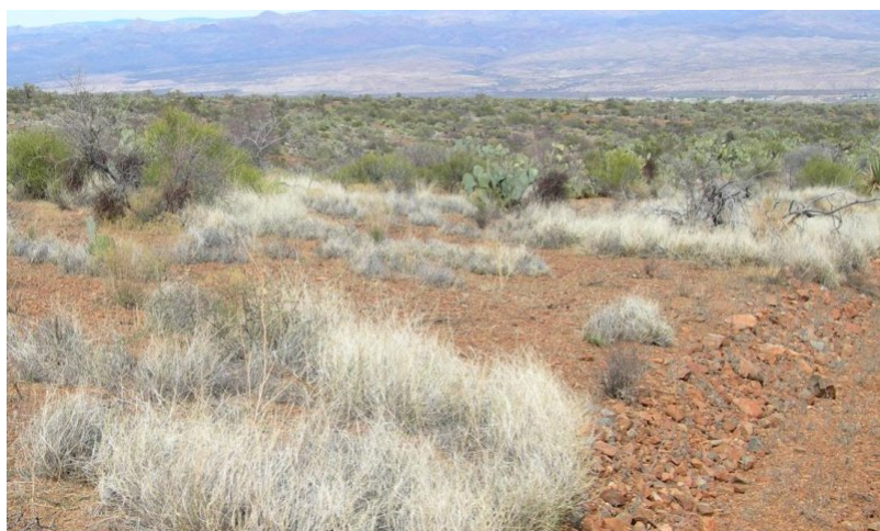
Figure 4. Clayloam Upland 12-16" pz., HCPC