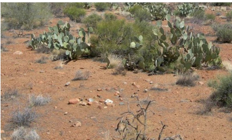
Figure 11. Clayloam Upland 12-16" pz., shrubby