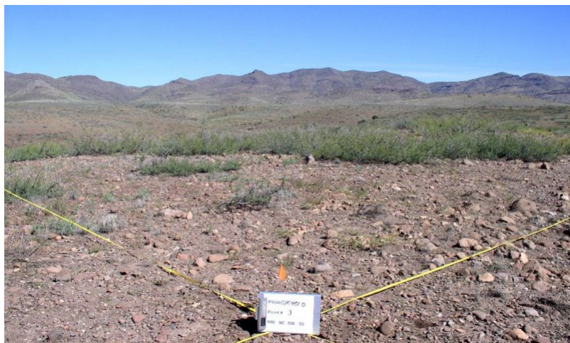
Figure 12. Clayloam Upland 12-16" pz., erosion