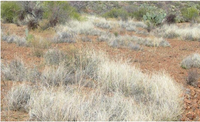
Figure 5. Clayloam Upland 12-16" pz., HCPC

The historic native plant community is dominated by tobosa and other warm season perennial grasses with a mixture of desert shrubs, half-shrubs, suffrutescent forbs and succulents. A rich flora of native annual forbs and grasses, of both the winter and summer seasons, exist in the plant community. Natural fires, which burned at moderate intervals in this region, helped to maintain a balance between perennial grasses and shrubs.