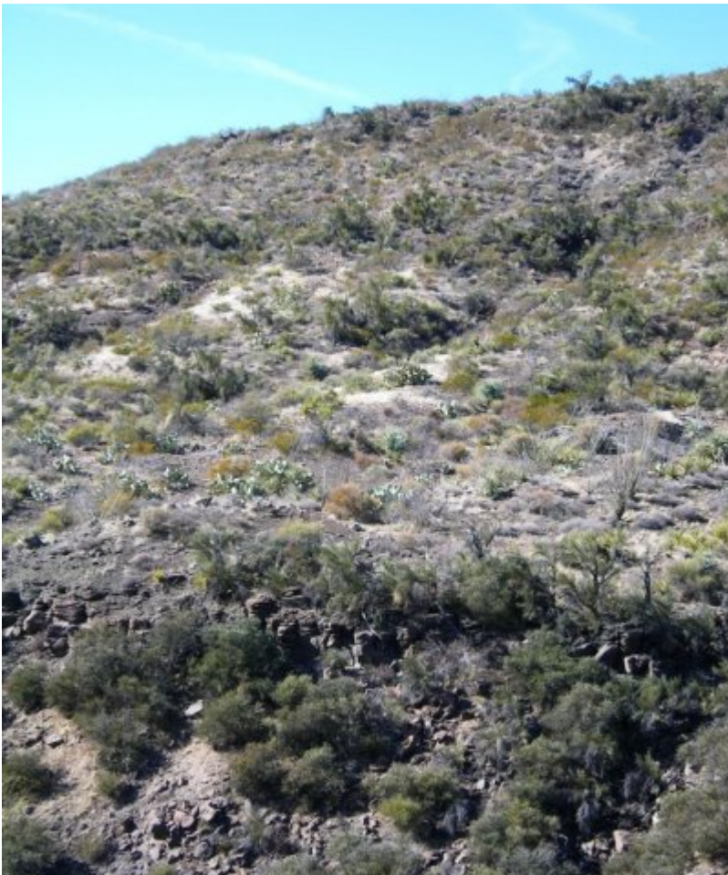
Figure 8. Basalt / Limestone Hills 12-16" p.z., shrubby

Perennial grass canopy cover is reduced due to the interactions of drought, grazing and / or fire. Desert shrubs and