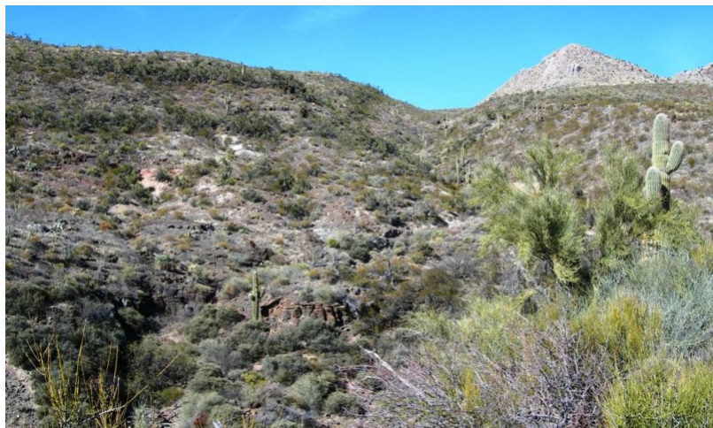
Figure 5. Basalt / Sandstone Hills 12-16" pz.

The historic, native, plant community is a diverse mixture of perennial grasses, suffrutescent forbs, shrubs, succulents and desert trees. A rich flora of native annual forbs and grasses, of both the winter and summer seasons, exist in the plant community. Periodic, naturally occurring, wildfires were important in maintaining the potential plant community. Northern exposures have a higher percentage of perennial grasses than will occur on south slopes. North slopes will also be more likely to experience tree increases especially juniper species, mesquite and canotia. Southern exposures will have a higher percentage of shrubs and succulents in the plant community. More xeric grasses will dominate southern exposures (aristida, tanglehead).