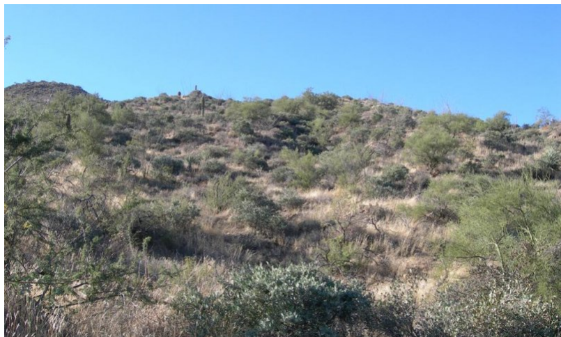
Figure 5. Volcanic / Metamorphic Hills 12-16" pz. HCPC

The historic, native, plant community is a diverse mixture of perennial grasses, suffrutescent forbs, shrubs, succulents and desert trees. A rich flora of native annual forbs and grasses, of both the winter and summer seasons, exist in the plant community. Periodic, naturally occurring, wildfires were important in maintaining the potential plant community. North slopes have a chaparral of evergreen shrubs like jojoba, turbinella oak and flatop buckwheat. Southern exposures will have a higher percentage of desert shrubs, trees and succulents in the plant community. More xeric grasses will dominate southern exposures (aristida, tanglehead). Grasses on cooler aspects include desert stipa and sideoats grama.