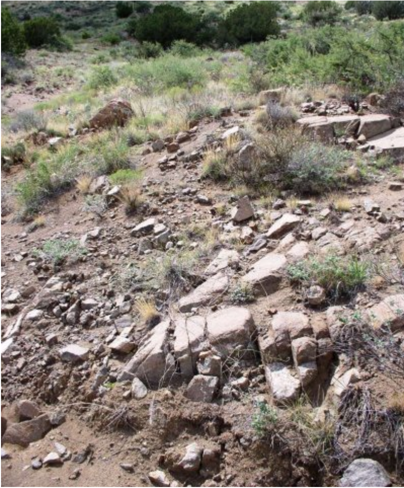
Figure 8. Diabase Hills 12-16" pz. eroded

Shrubs like catclaw and whitethorn acacia; trees like mesquite, juniper, ocotillo, blue paloverde, and succulents like prickly pear, cholla and banana yucca can increase to dominate the site in the absence of fire for very long periods of time. Native and non-native annual forbs and grasses dominate the under-story. In "El Nino" years, herbaceous fuels can be sufficient to carry fire through the heavy canopy of shrubs. The major woody shrubs are, however, fire resistant once established. Such fires would remove less tolerant species like cacti and leave intact the sprouting woody plants to become more and more dominant. Extreme rainfall events coupled with; the fire, drought and grazing interaction, can lead to rilling of steep slopes. Compaction of soils can occur with heavy trailing from continuous livestock use. Loss of plant cover after repeated fire can lead to accelerated rill erosion under these circumstances. Small gravel sizes (1/4 inch) are inadequate to prevent soil movement on steep slopes when the plant cover has been depleted.