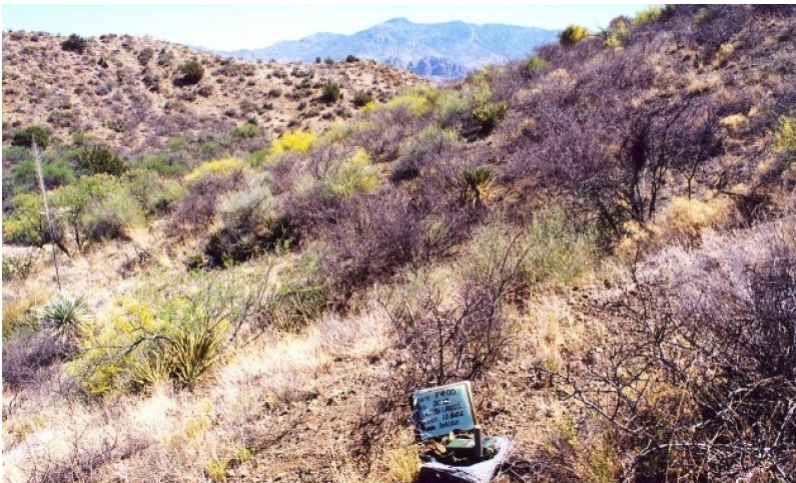
Figure 7. Diabase Hills 12-16" p.z. shrubby

Perennial grass canopy cover is reduced due to the interactions of drought, grazing and fire. Desert shrubs and cacti dominate the plant community. Shrub cover exceeds 40%. Annuals, both native and non-native, dominate the under-story. Fire frequency is reduced but the site can still burn, especially after "El Nino" years produce heavy fuel loads of annual grasses and forbs.