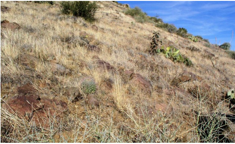
Figure 4. Diabase Hills 12-16" pz. HCPC

The historic native plant community is a diverse mixture of perennial grasses, suffrutescent forbs, shrubs, succulents and desert trees. A rich flora of native annual forbs and grasses, of both the winter and summer seasons, exist in the plant community. Periodic, naturally occurring, wildfires were important in maintaining the potential plant community. North slopes have more evergreen shrubs like juniper and turbinella oak. Southern exposures will have a higher percentage of desert shrubs, trees and succulents in the plant community. More xeric grasses will dominate southern exposures (aristida, black grama, bush muhly). Grasses on cooler aspects include desert stipa and sideoats grama.