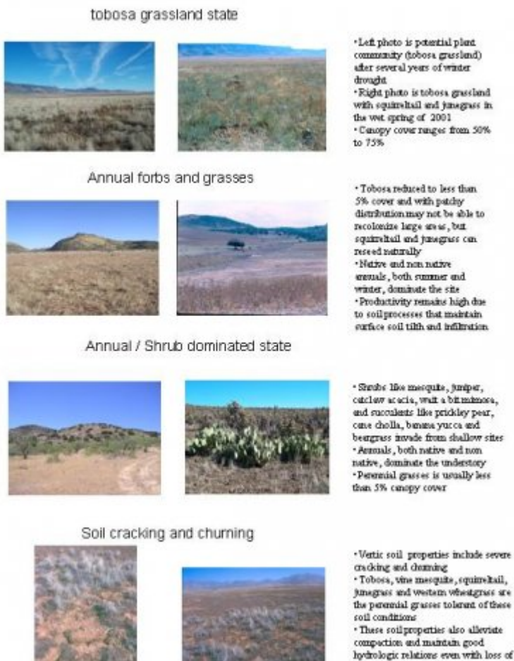
Figure 5. Clayey Upland 16-20" pz. photos

The historic, native, plant community is a grassland dominated by tobosa grass with lesser amounts of vine mesquite, blue grama, sideoats grama, black grama and curley mesquite. Prairie junegrass, western wheatgrass, muttongrass and bottlebrush squirreltail are an important group of cool season grasses in the plant community, but can diminish to low levels after severe winter - spring drought. A rich flora of native annual forbs and grasses, of both the winter and summer seasons, exist in the plant community. Periodic, naturally occurring, wildfires were important in maintaining the potential plant community.