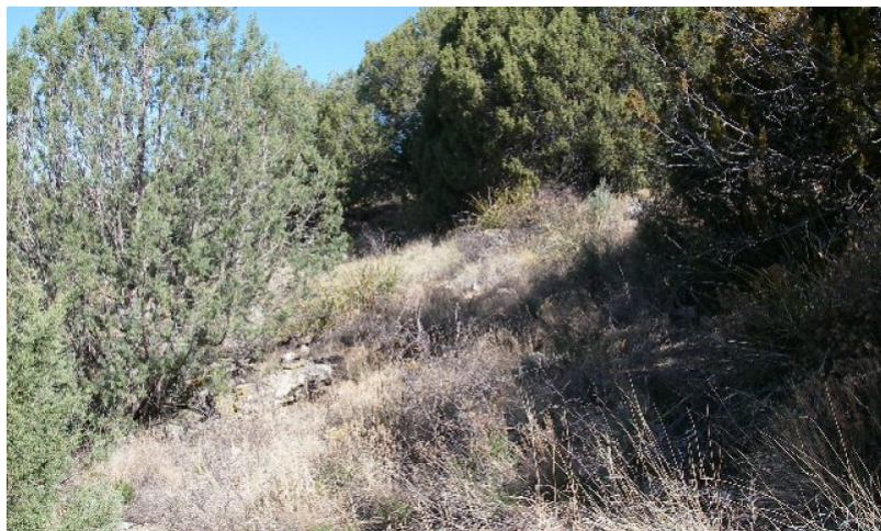
Figure 12. 4.1 Juniper-pinyon Community