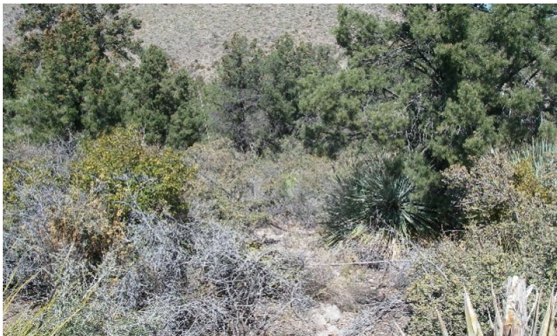
Figure 13. 4.1 Pinyon Community

Juniper and/or pinyon have increased to 40-50% canopy in the absence of fire for very long periods of time. The dominant juniper is one seed or redberry juniper. Herbaceous species are vigorous and evenly distributed in the interspaces of trees in areas where turbinella oak has not increased in the interspaces. These herbaceous species contribute to recovery of the site without the need for substantial inputs in the form of range planting. Turbinella oak has increased to 20-30% canopy in some areas where pinyon has increased to 40-50% canopy. Herbaceous species are less than 100 lbs/ac and not well distributed on the site. It is unknown if this community can return to the reference plant community. This would only be likely with range planting applied after wildfire.