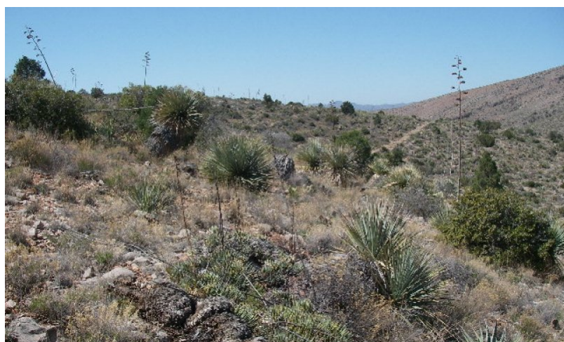
Figure 8. 1.2 Medium Canopy Shrub Community

Shrubs increase in canopy and density to approximately 45-60% canopy in the absence of fire. Herbaceous species are present in sufficient quantity and are evenly distributed to promote fire intensities sufficient to reduce abundance of shrub species.