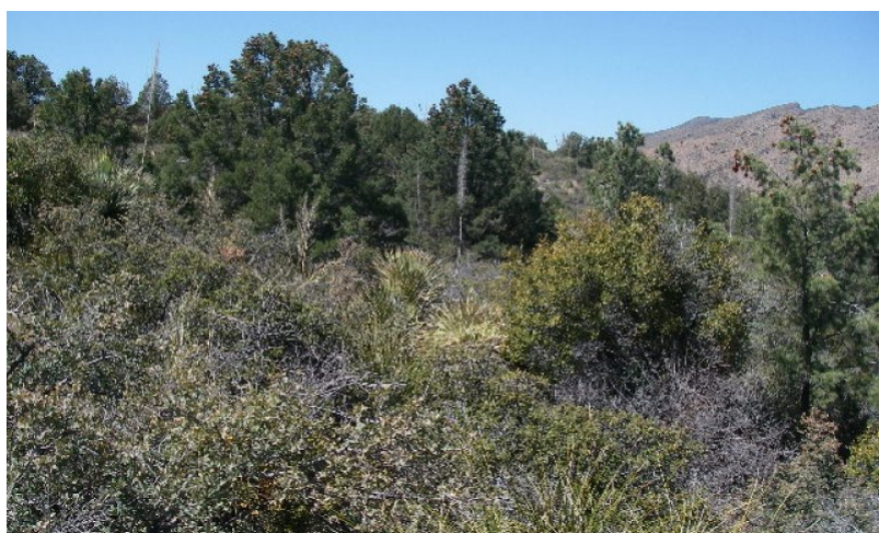
Figure 11. 3.1 Chaparral Community

Turbinella oak has increased to 60-80% canopy in the absence of fire for extended periods of time. Herbaceous species are less than 100 lbs/ac and are not well distributed on the site. A restoration pathway is unlikely from this state given the ability of turbinella oak to withstand substantial fire intensities (Pase 1965) and this species prolific root sprouting ability.