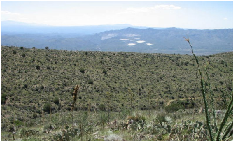
Figure 5. Limestone Hills RPC #2

The Shrub/Grass State is the Reference Plant Community. It is a diverse mixture of perennial grasses, suffrutescent forbs, shrubs, succulents and scattered trees. A flora of native annual forbs and grasses, of both the winter and summer seasons, exist in the plant community. Periodic, naturally occurring, wildfires were important in maintaining the Reference Plant Community. North slopes have a mixture of grass and evergreen chaparral shrubs like turbinella oak, mountain mahogany, and redberry buckthorn. Southern exposures will have a higher percentage of desert shrubs and succulents in the plant community. Shrub canopy is 35-45% on all aspects.