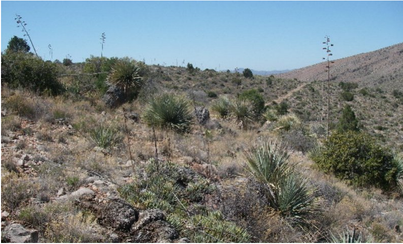
Figure 8. 1.2 Medium Canopy Shrub Community

Shrubs increase in canopy and density to approximately 45-60% canopy in the absence of fire. Herbaceous species are present in sufficient quantity and are evenly distributed to promote fire intensities sufficient to reduce abundance of shrub species.