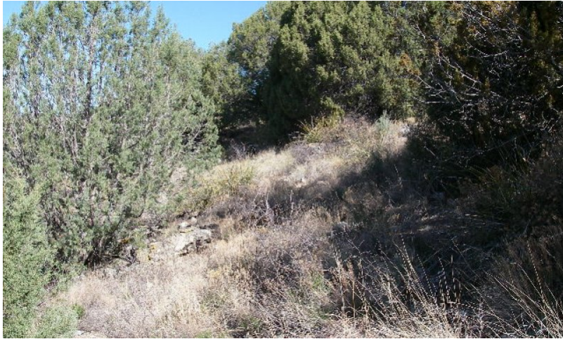
Figure 12. 4.1 Juniper-pinyon Community