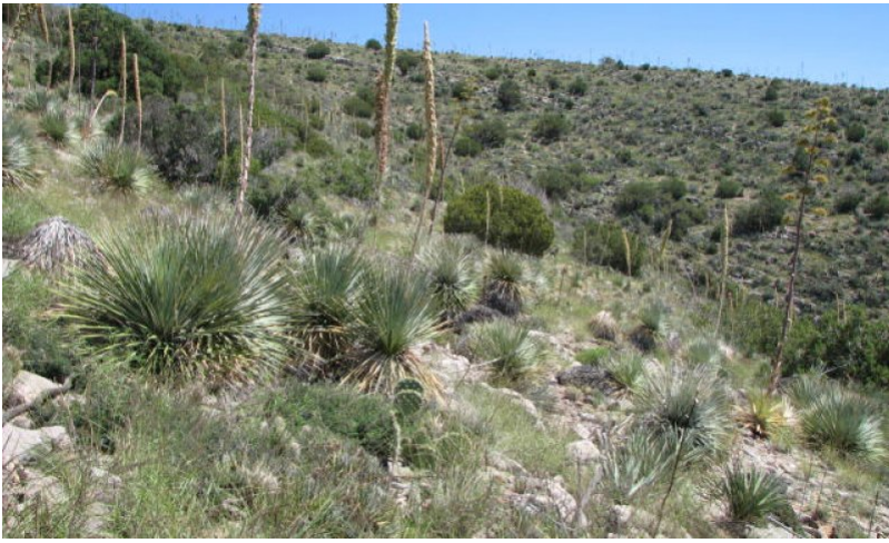
Figure 4. 1.1 Reference Plant Community