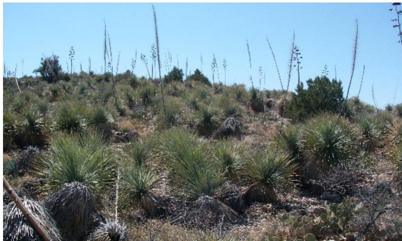
Figure 10. 2.1 Non-sprouting Shrub Community

Non sprouting shrubs have increased to 60-80% canopy. Cooler aspects are dominated by sotol and minor amounts of turbinella oak. Warmer aspects are dominated by prickly pear, ocotillo, agave, cat claw acacia, and minor amounts of wait a bit. Herbaceous species are less than 100 lbs/ac and are not well distributed on the site.