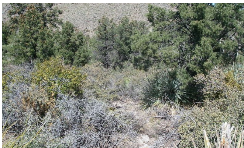
Figure 13. 4.1 Pinyon Community

Juniper and/or pinyon have increased to 40-50% canopy in the absence of fire for very long periods of time. The dominant juniper is one seed or redberry juniper. Herbaceous species are vigorous and evenly distributed in the interspaces of trees in areas where turbinella oak has not increased in the interspaces. These herbaceous species contribute to recovery of the site without the need for substantial inputs in the form of range planting. Turbinella oak has increased to 20-30% canopy in some areas where pinyon has increased to 40-50% canopy. Herbaceous species are less than 100 lbs/ac and not well distributed on the site. It is unknown if this community can return to the reference plant community. This would only be likely with range planting applied after wildfire.