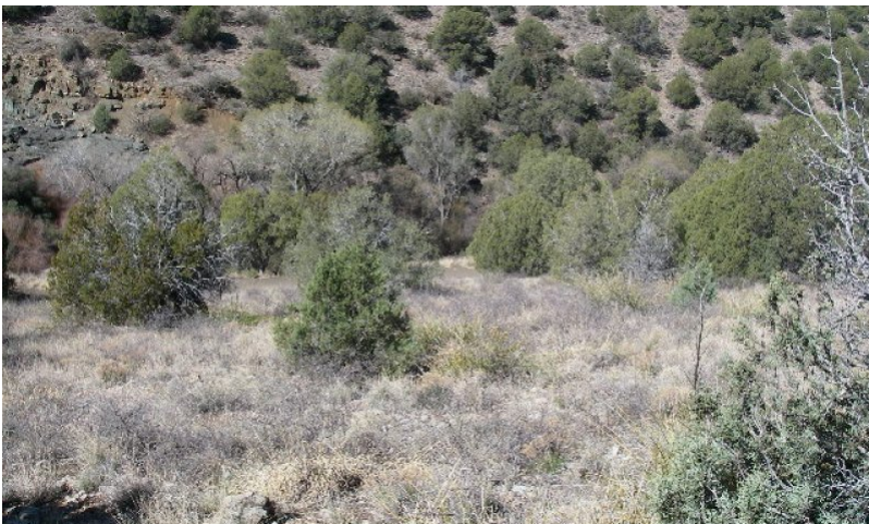
Figure 9. 1.3 Mixed Life Form Community

Juniper or pinyon germinate and are present at densities of 5-10 per acre and are still small in size. One seed or