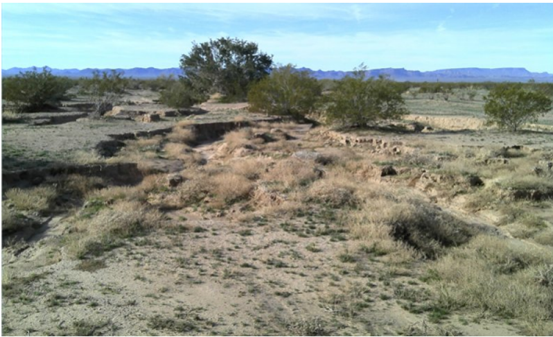
Figure 10. Limy Fan, 7-10" p.z., Eroded