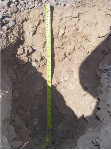
Figure 4. Gunsight