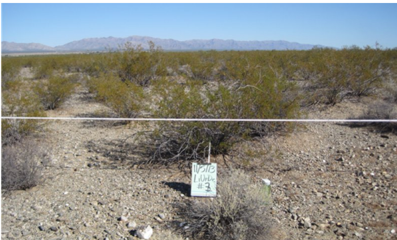
Figure 5. Limy Upland, deep

The potential plant community is dominated by scattered creosotebush with a few other shrub and cacti species. Annual grasses and forbs make up a small percentage of the plant community. The aspect is shrubland. Due to the unpalatable nature of creosotebush and associated shrubby species in the potential community, there is little change in species composition even with heavy grazing pressure. A few cool season, introduced annuals like; red